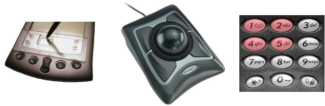
Figure 2. EdgeWrite will be designed, implemented, and evaluated for use on a PDA with a stylus by people with tremor, on a trackball by motor-impaired trackball users, and on a mobile phone by able-bodied users who are walking or riding.

To date, we have shown the stylus version of EdgeWrite to be over 18% more accurate than Graffiti for able-bodied users and 2-4 times more accurate for some users with motor impairments [9]. We have also implemented EdgeWrite for power wheelchair joysticks and touchpads as integrated control devices for desktop text entry [8]. Along the way, we have developed methods of improving the guessability of symbolic alphabets [7] and in creating algorithms for improving text entry error rate analysis by extending the work of Soukoreff and MacKenzie [6] on text entry method evaluation.