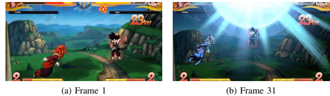
Fig. 1: Hit stop in Dragon Ball FighterZ

B2. Focus of Attention. Does the game feature feedback elements that draw your attention?