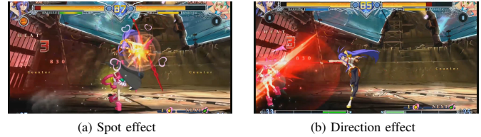
Fig. 2: On-hit effect in BlazBlue Centralfiction

B2.1 On-Hit effect. The difference to after-hit effect, described above, is that those are effects applied to communicate the impact of your strike. While the on-hit effects are spot-pattern effects that try to highlight the hit's position. Besides, on-hit effect can express more than just pointing out the impact position. Some games will apply on-hit effect with different patterns to distinguish the armaments used. Figure 2 shows that the on-hit effect varies for various weapons in BlazBlue Centralfiction 13 . The spot pattern is employed for fist and blunt objects, while an extra directional effect is applied when sharp weapons like spear and sword have slashed at the target.