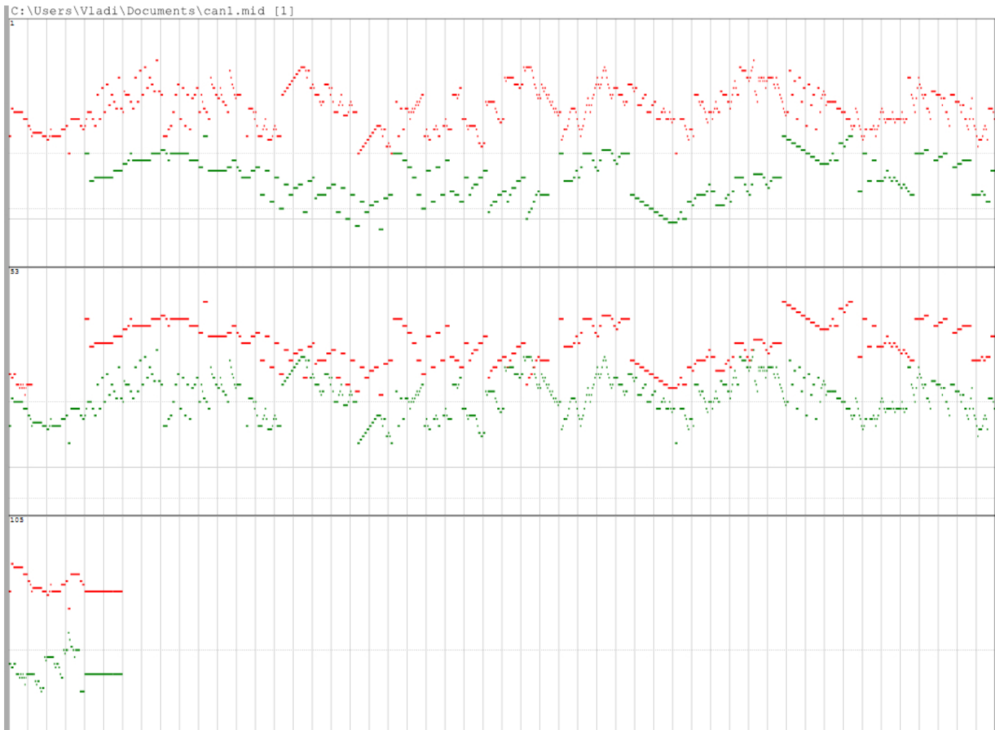
Figure 3: The Sloth Canon from the KdF

[ ] At the lectures, I presented a new theory/hypothesis/explanation why the last fugue is unfinished. This will not fit in these Notes - see the www page above for details.