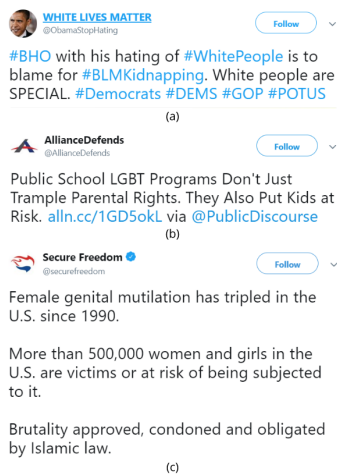
Figure 1: Tweets by extremist accounts from our corpus. By drawing from sociological theories of framing our codebook applies to a wide variety of hate groups, among which anti-LGBT, anti-Liberal, anti-Islamic, and pro-White hate groups in the examples above.