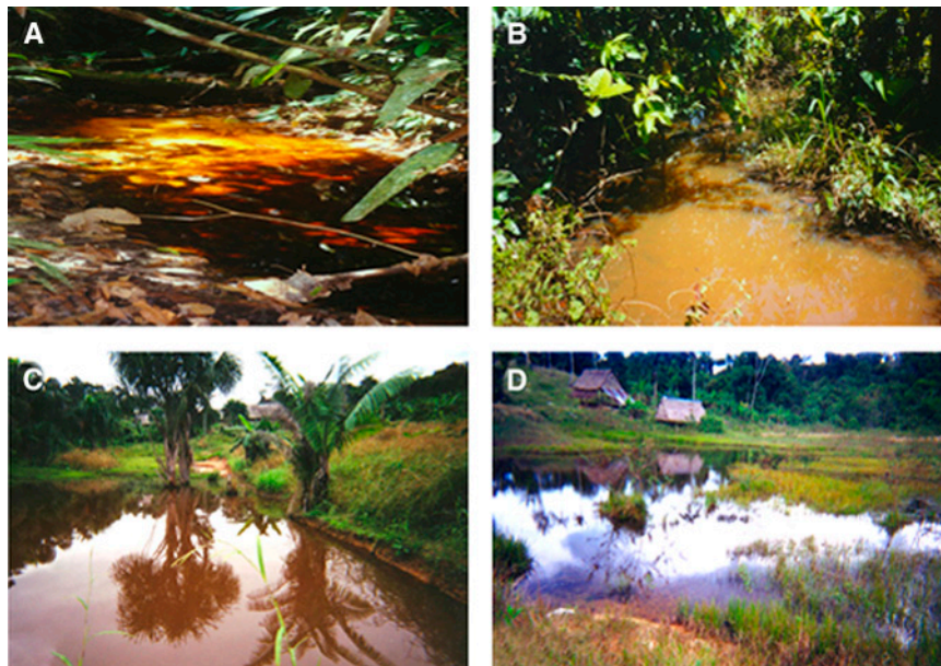
FIGURE 2. (A) Bodies of water in forest, (B) secondary growth, (C) grass/crop land, and (D) fish farm (aguaje palm depicted center-left). This figure appears in color at www.ajtmh.org

Mapper [TM] satellite image and a population census conducted before the start of larval collections). Sixteen sites were in village areas, 12 in lowly populated, deforested areas, 12 in secondary forest, and 16 in primary forest. We then created transects extending 500 m due north and south of the adult Anopheles collection site for a total of 1 km. If time