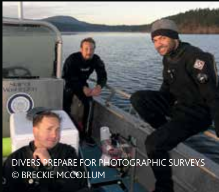
DIVERS PREPARE FOR PHOTOGRAPHIC SURVEYS

communities have remained relatively stable. Even with the introduction of a no-take urchin zone in 1984, species numbers did not appear to change significantly compared to data from the same walls collected in the 1960s by then FHL graduate student Charles Birkeland, a now well-known coral reef ecologist. This research has highlighted the key function rock walls play in offering a shelter for marine species, compared to horizontal or sloping surfaces that are more frequently grazed by urchins and other consumers. Elahi explains: "We suggest that subtidal rock walls may serve as potential refugia of biodiversity, and emphasise the need for long-term ecological monitoring with consistent methodology to help understand this function more fully".