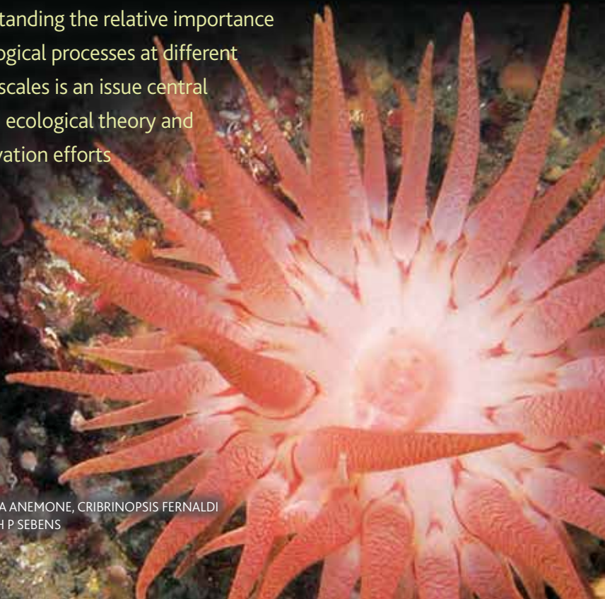
THE RED SEA ANEMONE, CRIBRINOPSIS FERNALDI