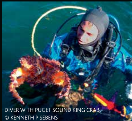
DIVER WITH PUGET SOUND KING CRAB, © KENNETH P SEBENS

This project aims to deliver a comprehensive analysis of the ecological interactions between predators and prey and how any changes impact