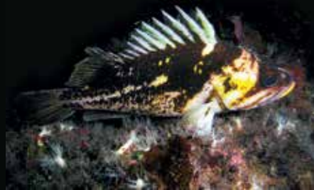
COPPER ROCKFISH