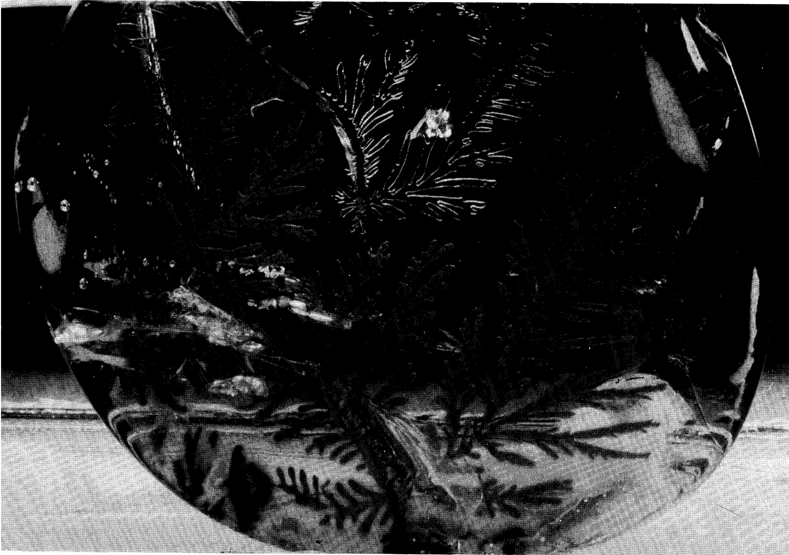
FIGURE 2. Viscous fingers in a chunk of amber. This photograph by Paul A. Zahle, Ph.D. is © 1977, National Geographic Society. It has appeared in the National Geographic Magazine in September 1977, pp. 434–435. To quote from the accompanying text by T. J. O'Neill, 'apparently a tiny crack developed in an already solidified lump of resin; fresh, sticky resin then began to fill the narrow crevice. Air also crept along the fracture plane, thus forming the array of mosslike pseudo-fossils. Some foreign substance – perhaps iron oxide – [provided color]' ... 'The classical Greeks called [amber] electron .' ... 'Not until when the Roman author Pliny made public his Historia Naturalis , was amber scientifically described as a product of the plant world.' Not until fractal geometry had become available, could the 'array of mosslike pseudo fossils' be recognized as an example of viscous fingering, and could become an object for quantitative study.