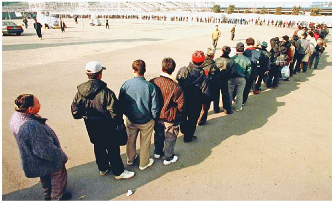
외환위기는 가진 거라고는 노동력밖에 없는 저임금 노동자들에게 더 큰 고통이었다. 사진은 1998년 12월25일 성탄절날 서울 용산역 광장에서 실직자들이 음식을 배급받으려고 줄지어 서 있는 모습이다 한겨레