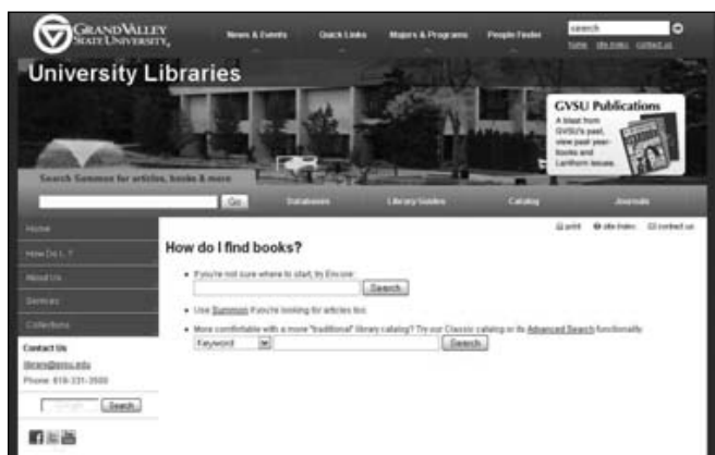
Figure 2: Grand Valley State University Libraries catalog search page