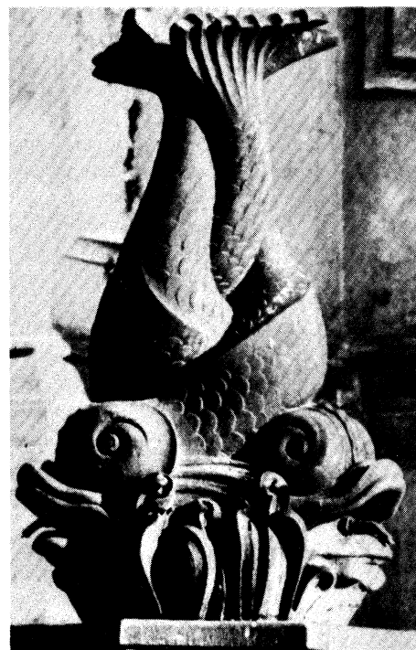
Two- and three-fold rotational symmetries, displayed by sculptures of a pair of fish in Washington, D.C. [left], and a trio in Prague [right].