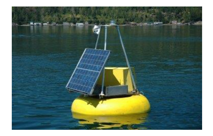
Figure 3, Puget Sound ORCA (Ocean Remote Chemical Analyser)

this allows response teams to know when and where to place mitigation devices as well as to trace back to a potential source spill.