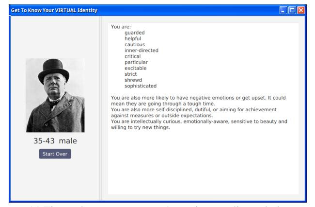
(c) The service returns age, gender, and personality analysis.