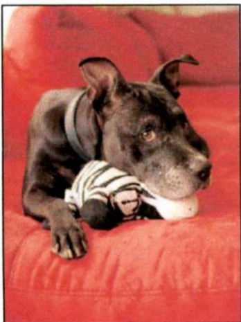
Looking for a place to hang with your dog?

Dog City Bakery and Café, located at the corner of 3rd and Clay, is the marriage of dog park and bakery; like your living room with really good coffee. This unique retail space is located at the brand-new Mosler lofts, the LEED-certified building that has garnered media attention lately for its New York style lofts and green construction.