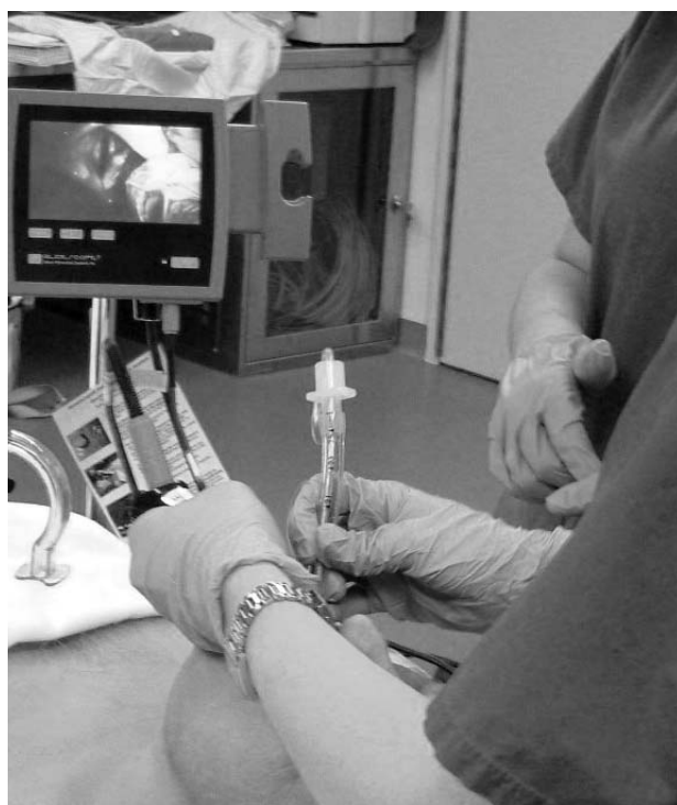
FIGURE 2 Laryngoscopy and endotracheal tube (ETT) insertion. The GlideScope® (GS) has been inserted into the vallecula and the epiglottis is seen at the top of the monitor. The ETT cuff is seen as it approaches the glottis [Cormack-Lehane (C/L I view)]. Note that the laryngoscope has been introduced in the midline, as has the ETT.

C.) or under their direct supervision, the GS was made available to anesthesiologists at The University Health Network (consisting of Toronto General Hospital, Toronto Western Hospital and Princess Margaret Hospital, Toronto, ON, Canada), Burnaby Hospital (Burnaby, BC, Canada) and Veterans Affairs Puget Sound Health Care System (Seattle, WA, USA) for use in their clinical practice.