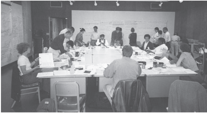
Figure 1. Berkeley conference, 1998.