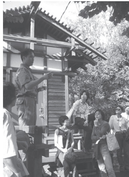
Figure 5. Tour of Danny Woo Community Garden in Seattle's International District.