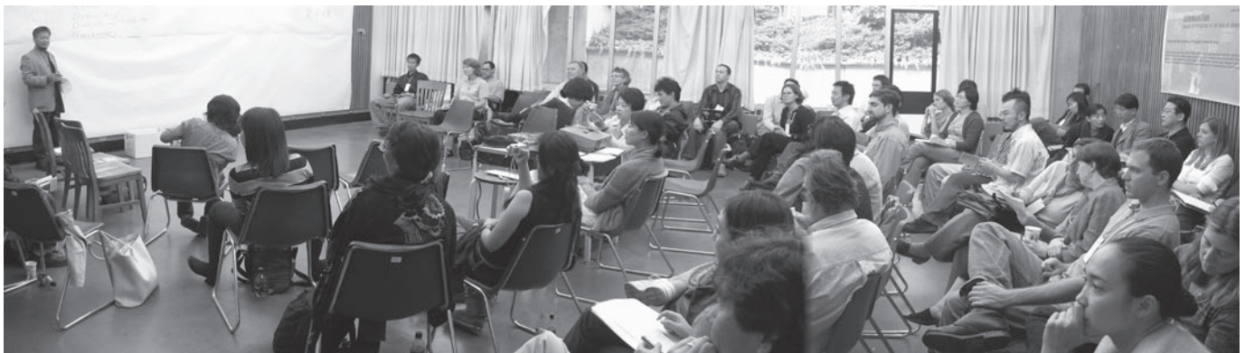
Figure 3. Seattle conference, 2004.

was launched in Berkeley in 1998. Inspired by shared interests and experiences, members have undertaken collaborative research to investigate differences and shared lessons in community design in their respective institutional, political and social contexts. Some have taken a deliberately cross-cultural framework to bridge community design practices through joint studios and comparative research. Over the years, many have participated in each other’s community-based work. Through regular conferences and joint projects, the network has provided a vehicle for collaboration and mutual support, as well as a forum for comparative understanding of community design in the Pacific Rim.