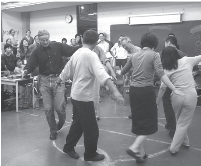
Figures 11 and 12. Performing the keywords.