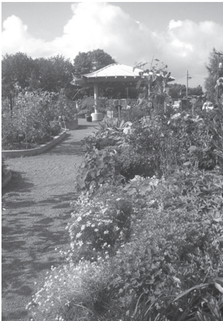
Figure 6. Children's Garden at Bradner Garden Park, Seattle.

Through fostering people's connection to place, participatory mechanisms have also become increasingly recognized in engaging people in environmental stewardship and activism. The papers in Chapter 12 examine different forms of citizen engagement with a common focus on the protection of creeks and watersheds. Victoria Chanse and Chia-Ning Yang provide an overview on how stewardship of urban nature has changed