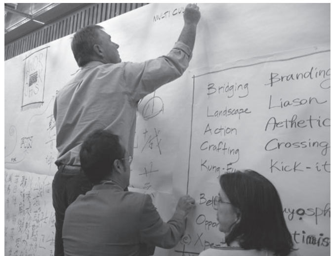
Figures 8 through 10. Groups working on reflections of the conference through 'keywords' at closing workshop.