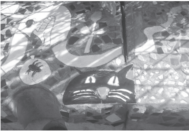
Figure 7. Children's art at Bradner Garden Park.

In community development and design, youths represent a frequent group of constituents and participants. It is widely assumed that youth involvement can contribute positively to the society and instill a sense of civic responsibility and citizenship among youths. However, participation of youths in community design also faces numerous challenges. In Chapter 14, Jonathan London describes a lack of linkage between youth and community development in practice. To address this issue, he presents a method of youth-led research, evaluation and planning in linking youths and community development. In the face of commercialism and commodification of youth culture, Isami Kinoshita also argues that the nexus between youth participation and community planning is important in restructuring the relationship between youth and community. On the need to engage and empower youths, Elijah Mirochnik reflects on his role as a teacher and experiences in working with children. Specifically, he explores the use of a transgressive vocabulary that challenges old notions about knowledge, teaching and learning. To demonstrate a critical approach to youth involvement, Michael Rios presents the case of a youth art project in the North Cheyenne reservation in the United States to illustrate the use of community-based design and art as a vehicle to explore issues of identity, landscape and civic engagement.