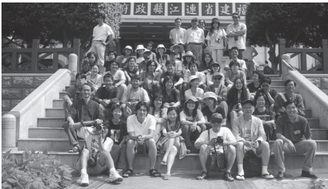
Figure 2. Taiwan conference, 2001.