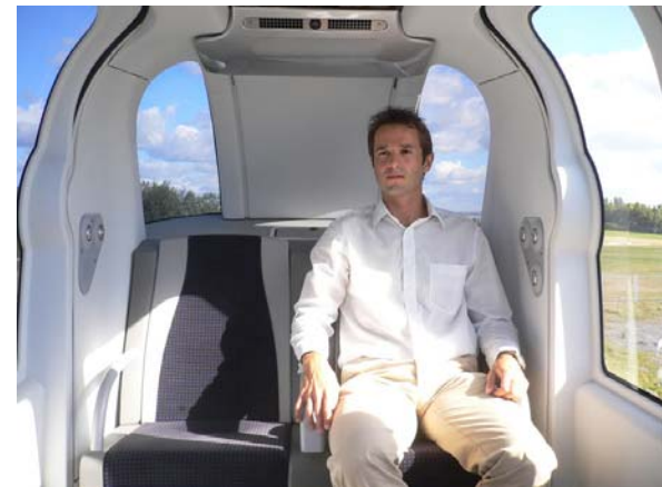
Image of ULTra Podcar interior