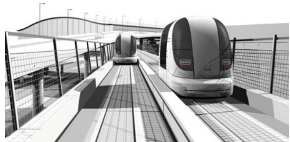
Artist rendition of completed ULTra system

The ULTra system is highly adaptable. Modular design and construction techniques makes addition of further routes straightforward.