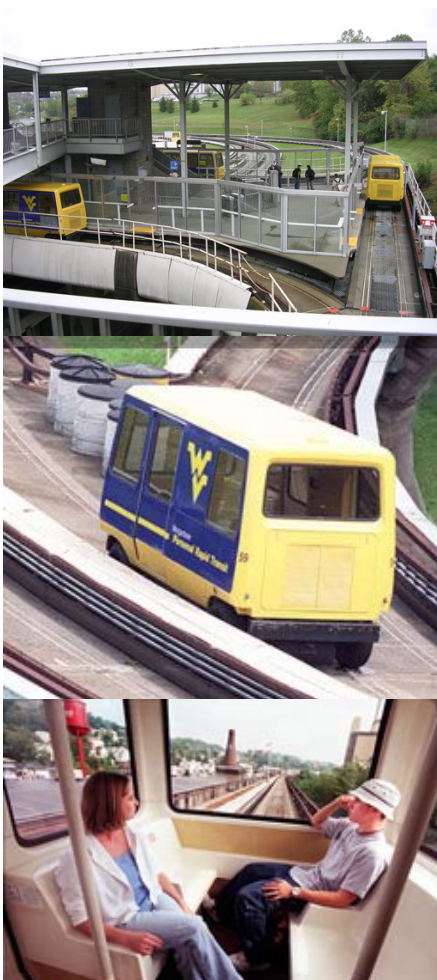
Images of the West Virginia PRT