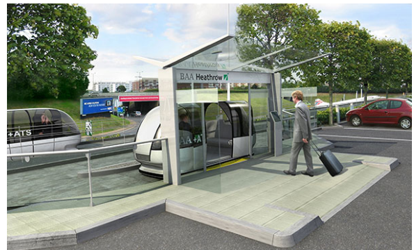
Artist rendition of ground level PRT station