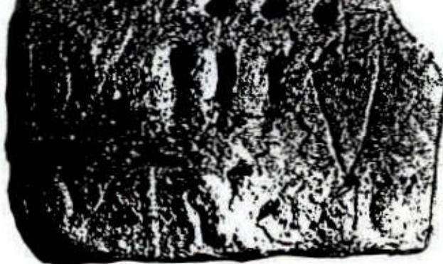
Incised tablet showing an account of thirty-three jars of oil(?). Godin Tepe (Gd 73-295), Iran.