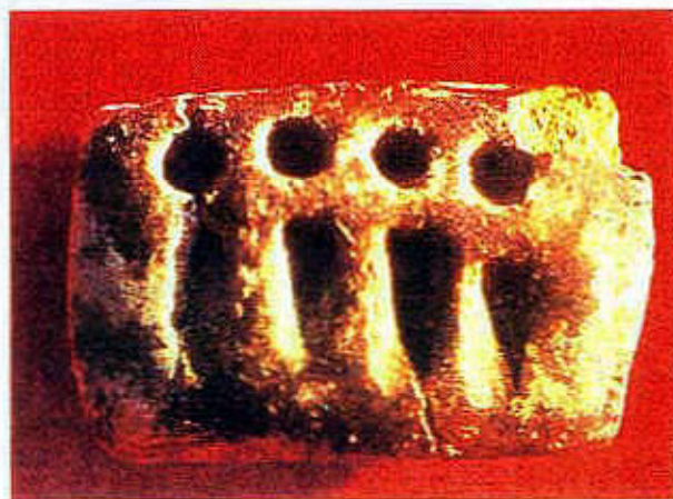
MUSEUM OF HISTORY AND CULTURE, BERLIN