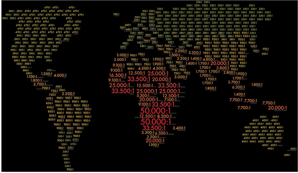
NUMBER OF INHABITANTS PER DOCTOR. Data from The World Health Report 2006. Modified version of image produced by EuroRSCG Amsterdam for Dokters van de Wereld/Médicins du Monde Netherlands (used with permission). This figure and the text discussion do not take into account that most doctors work in urban centers and that having a doctor that one cannot afford to get care from does one no good.