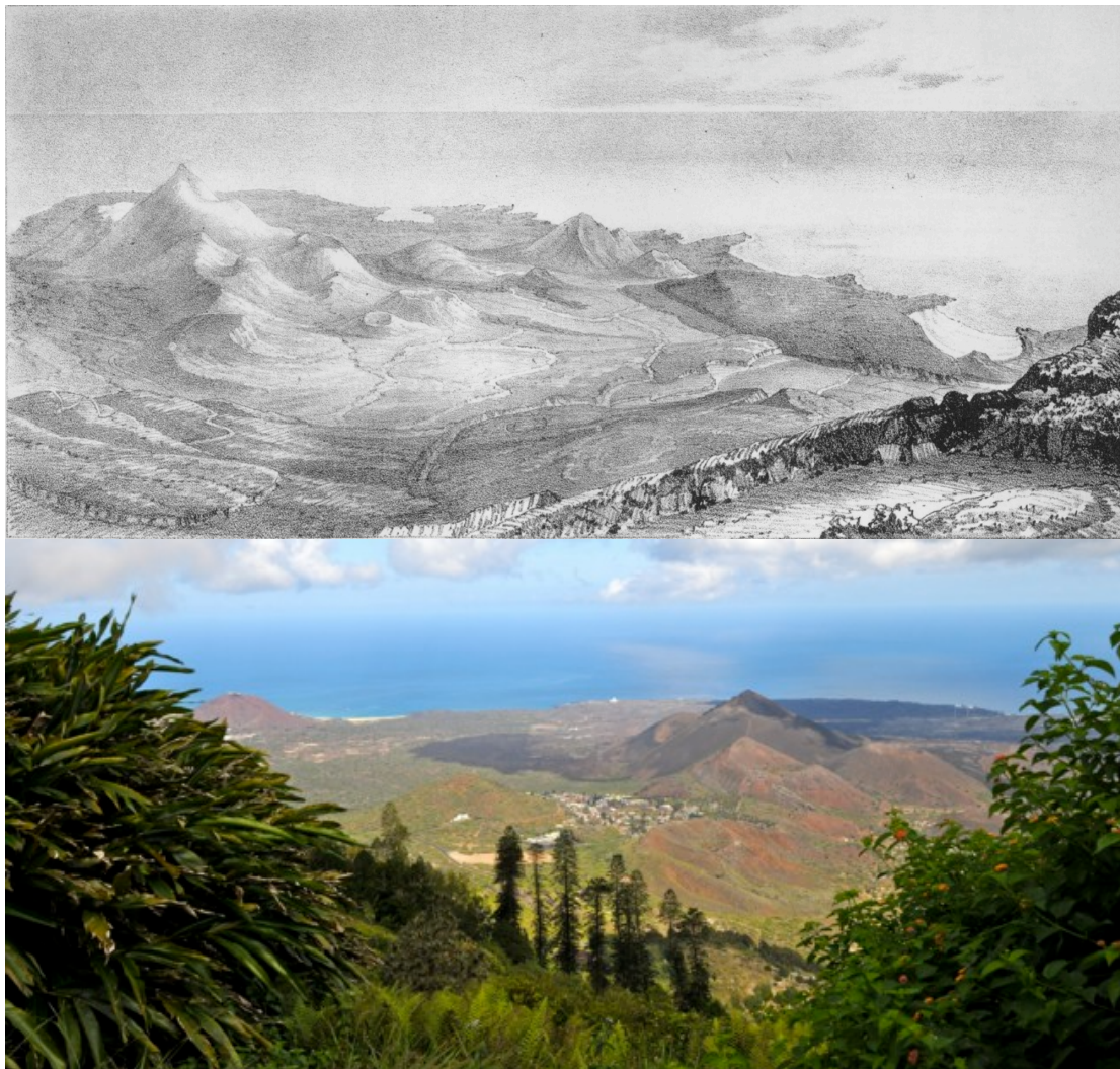
Fig. 4. UPPER: A drawing published in 1835 by Capt. Henry Brandreth entitled "From Mountain Road", showing cinder cones on barren plains beneath Green Mountain 11 . LOWER: A photo from a similar altitude in 2012 showing vegetation on the mountain itself and on the plains below. (Photo: DCC).

Georg Forster, on Captain Cook's Resolution saw goats eating purslane, ferns and grass on Green Mountain. Forster was the first person to suggest reshaping the landscape 10 : "I am almost persuaded that with a little trouble, Ascension might shortly be made fit for the residence of men. The introduction of furze...and other plants which thrive best in a parched soil, and are not likely to be attacked by rats or goats, would soon have the same effect as at St. Helena. The moisture attracted from the atmosphere by the high mountains...would then no longer be evaporated by the violent action of the sun, but collect into rivulets, and gradually supply the whole island...grasses would everywhere cover the surface of the ground, and annually increase the stratum of mould, till it could be planted with more useful vegetables."