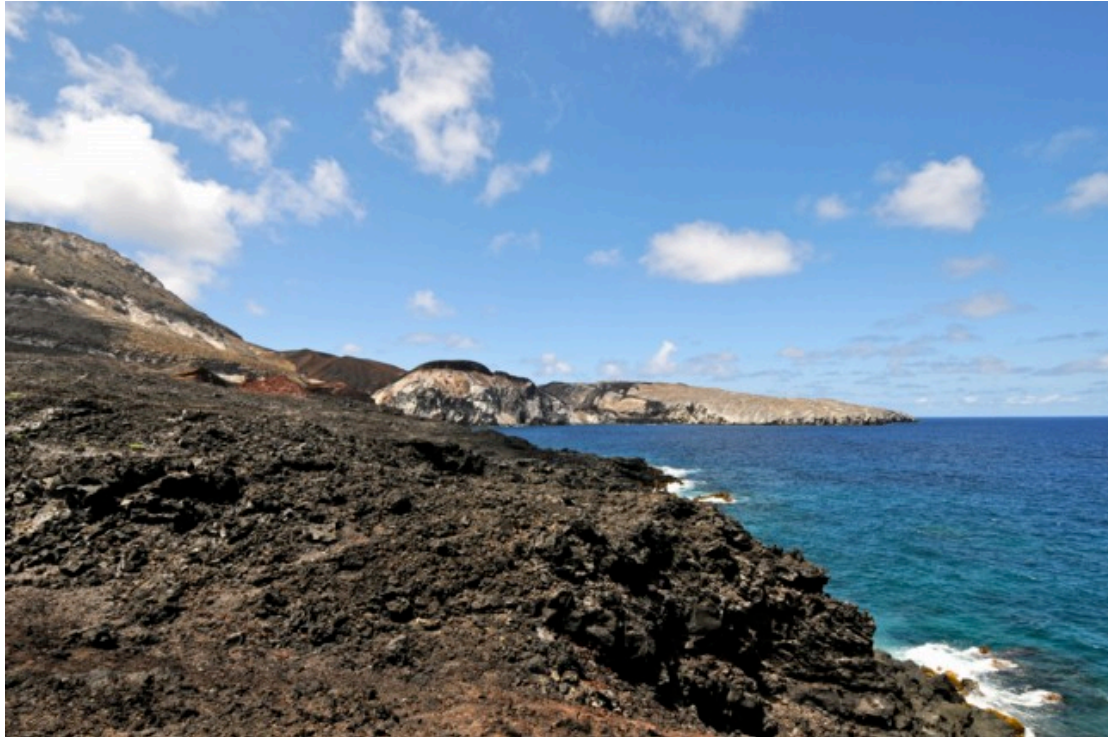
Fig. 2: Parts of Ascension Island are as barren today as they appeared to the first explorers. This view is towards South East Bay and Letterbox peninsula. In the foreground are jagged, so-called “a’a” lavas.

The starkness of Ascension results from its young geologic age and sparse rainfall. The island emerged from the ocean one million years ago and represents the tip of an undersea volcano growing on a hot spot on the western flank of the mid-Atlantic ridge 2 . Some pristine, unweathered lavas suggest that volcanism may have occurred within the last 1000 years 3 . Because of the young geologic age, few plants or animals have had time to arrive on wind or ocean currents and evolve into new species. When sailors first visited, the only obvious traces of greenery were grass and small ferns on the windward side of Green Mountain, where a little moisture was gathered. In pre-human times, the total number of plants was probably around 25 to 30, of which ten were endemic a : two grasses, two shrubs, and six ferns 4 . Today’s verdant foliage on Green Mountain of 200-300 species is overwhelmingly artificial 5 .