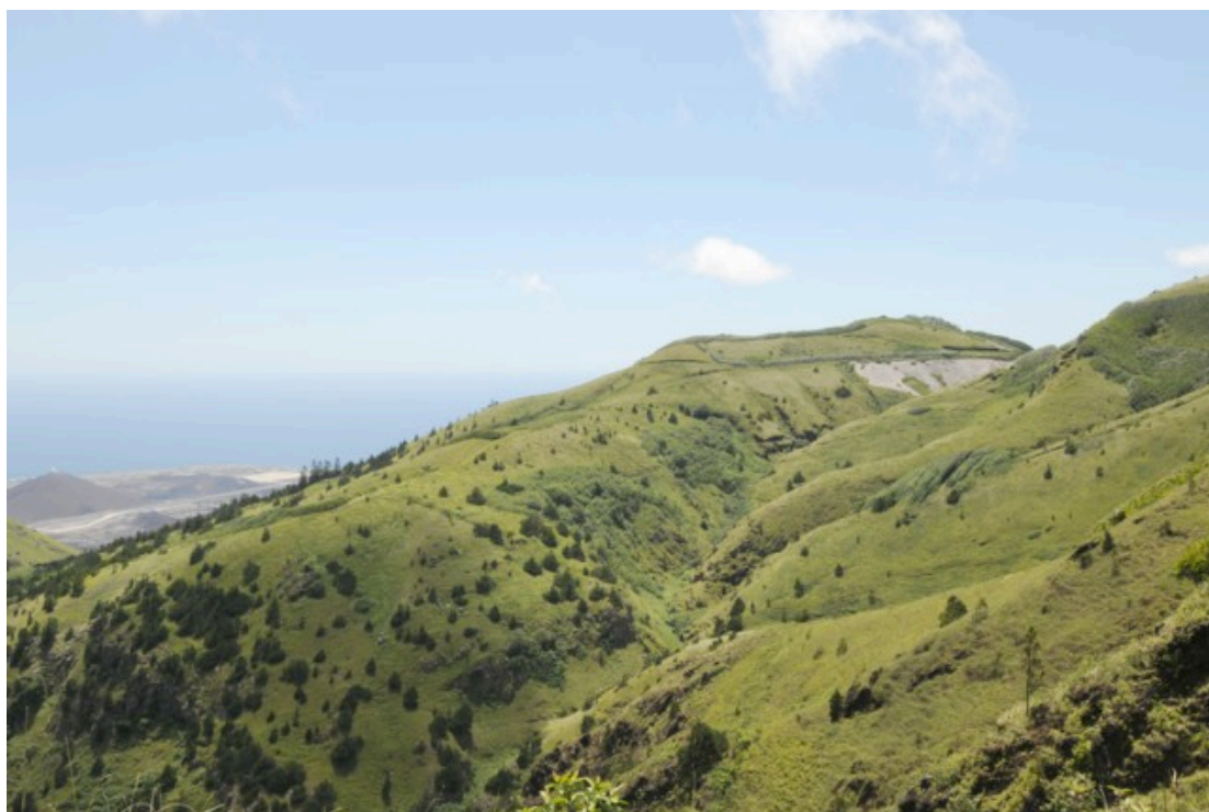
Fig. 3. Breakneck Valley, where William Dampier discovered a spring in 1701. At that time, the valley would have been treeless with little vegetation. The concrete catchment in the upper right was built in the late nineteenth century to collect rainwater. It was the island’s main water supply until the 1960s.

Before Ascension was settled, various travelers described a land largely devoid of vegetation. But Green Mountain was never a blank canvas. On a repeat visit in 1656, Peter Mundy noted that “the tops of the high mountains in the middle appeared somewhat green, there being a kind of rushes and spicy [spiky] grass” 1 . Then, in a limited survey in 1698, James Cuninghame described five plant species 6 .