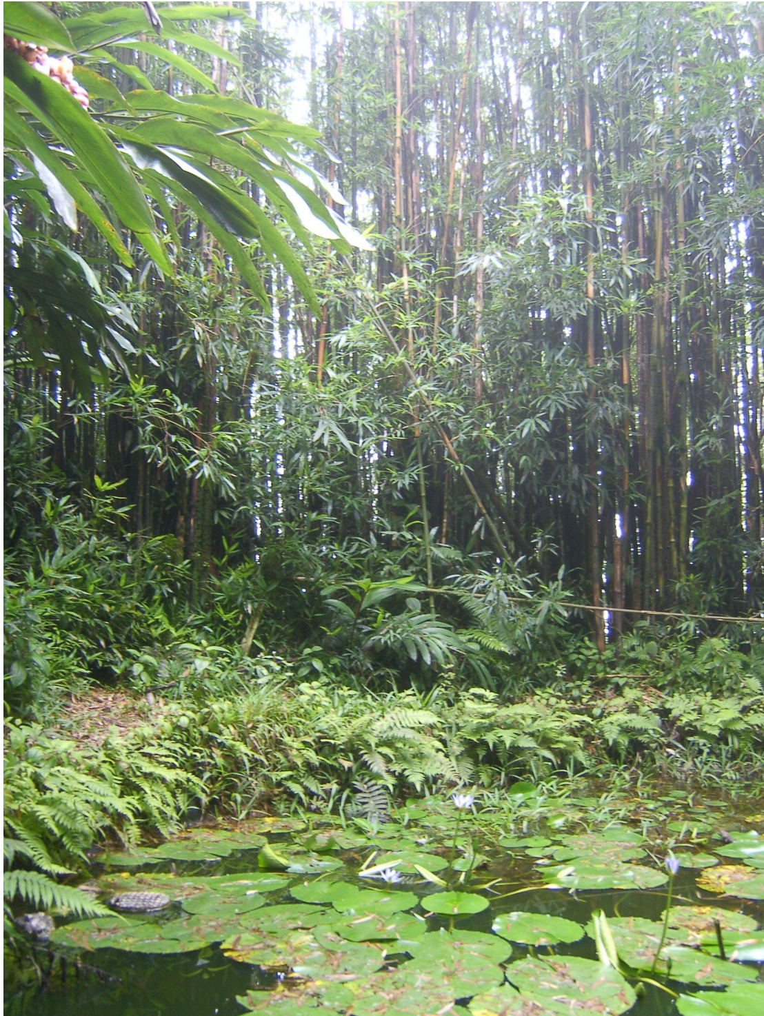
Fig. 6. The Dew Pond at the summit of Green Mountain. It now exists where once there was a scantily vegetated, windswept landscape, which Darwin compared to “the worse parts of the Welsh mountains”.