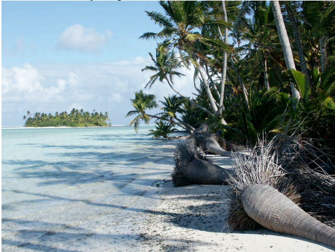
The interior lagoon of Cocos (Keeling), the atoll that Darwin discusses at length in his theory of coral reefs. Fig 6

the volcanic rock and upward growth of coral.