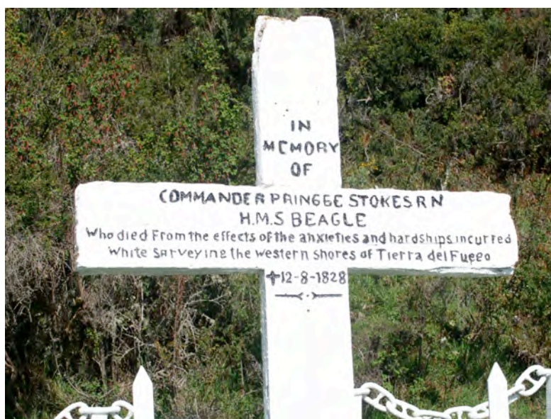
Fig. 1: The suicide of Capt Pringle Stokes resulted in Robert Fitzroy taking command of the Beagle on its first voyage and the sequence of events that ultimately led to the Beagle 's voyage with Charles Darwin. Stokes' grave, shown here, lies south of Puerto Hambre on the Straits of Magellan, Chile. The cross is a replica; the original cross is now in the Salesian Museum in Punta Arenas, Chile. Fig 1

To place Darwin's voyage in context, we must start with some background. After dropping out of medicine at the University of Edinburgh, Darwin took up theology at the University of Cambridge. Nature and geology were his hobbies, and perhaps Darwin might have become another Gilbert White had it not been for a chance event in 1831.