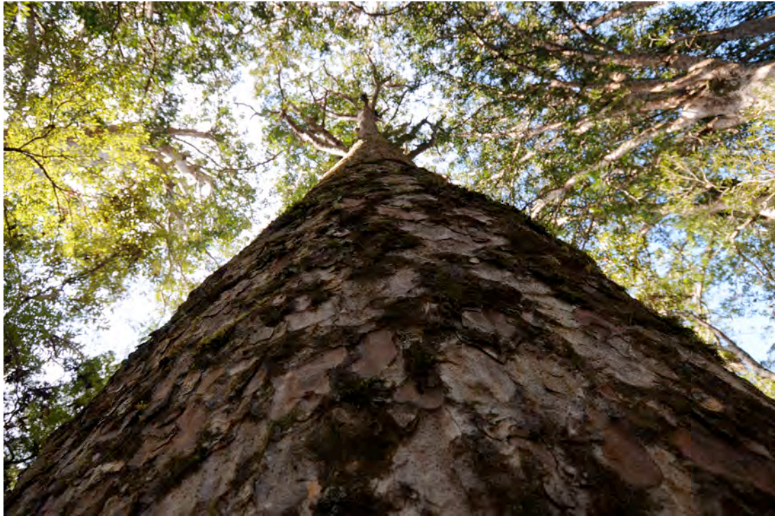
The kauri ( Agathis australis ) in the Bay of Islands, New Zealand, is a tree of great antiquity whose ancestors arose around 135 million years ago. Fig 3

New Zealand has also experienced massive deforestation, which Darwin believed had occurred even prior to his visit. In the Bay of Islands, in 1835, Darwin walked through plains of thick fern. He noted that: