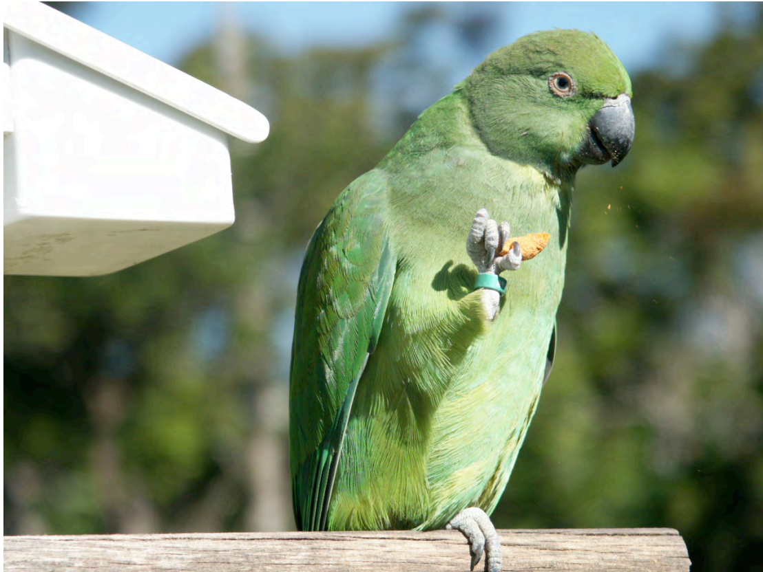
An echo parakeet ( Psittacula eques ) within the captive breeding programme of the Mauritius Wildlife Foundation. The bird was common in Darwin's time but declined to a population of about 10 known birds the 1980s. This is a female, distinguished by her grey beak, which in the males is pink. Fig 4

In Mauritius, Darwin's virgin forest was again largely wiped out. In the 1970s, thousands of hectares of native forest were cleared and replaced with Florida pine. Unsurprisingly, native forest was precisely the habitat favoured by endemic birds. In the 1980s, the echo parakeet almost became extinct and was only saved by captive breeding. In 1991, the pink pigeon population collapsed down to ten individuals and again was only rescued from extinction by conservationists.