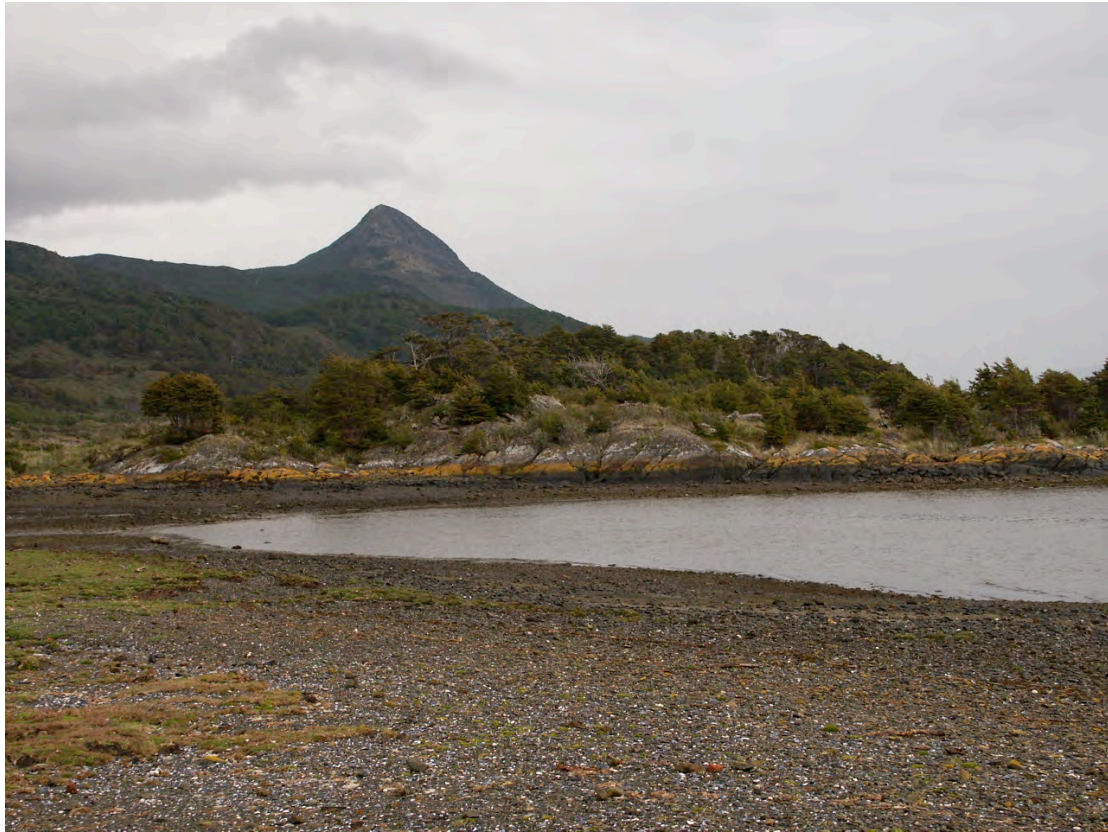
Wulaia, Navarin Island, where Fitzroy landed his three Fuegians. Fig 2

The original inhabitants of Tierra del Fuego consisted of four main groups: coastal people, the Yahgan (or Yámana) and Alakaluf, and inland-dwellers, the Selk'nam (or Onas) and Hausch. The pre-Magellan population of all the tribes was probably around ten thousand. 5 York Minster and Fuegia Basket were Alakaluf, while Jemmy Button was Yahgan. Wulaia was Yahgan territory and today is deserted. Grassy mounds of mussel shells – middens – are all that remain of the Yahgans. It is strangely eerie to stand on the middens amongst the gnarled southern beech trees and witness a serene scene of windswept emptiness, knowing that this was once bustling with Yahgan canoes, the shouts of women, and laughter of children. The Yahgans had been in Tierra del Fuego for at least 6000 years when Europeans brought an epidemic in 1863 that reduced their numbers from 3000 to 2000, killing Jemmy Button in 1864. 6 Later epidemics, including measles, virtually exterminated the Yahgans while commercial fishing depleted their hunting grounds of seals and whales. By the beginning of the twenty-first century, just one full-blood Yahgan remained, an elderly woman living near Puerto Williams, Chile. Meanwhile, the Alakaluf had dwindled to about a dozen. Darwin's Fuegians are no more.