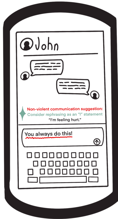
Fig. 3. Participants imagined ways to provide more attuned communication with each other, including highlighting and suggesting non-violent communication. Here, the research team illustrates what this might look like.