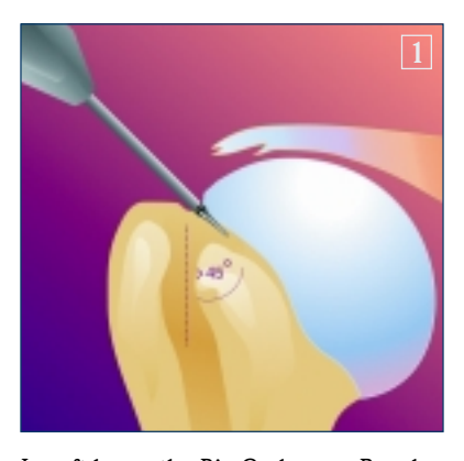
In soft bone, the Bio-Corkscrew Punch is used.