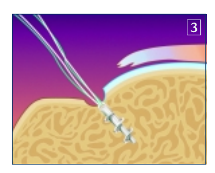
One or more Bio-Corkscrews are turned in with the disposable driver.