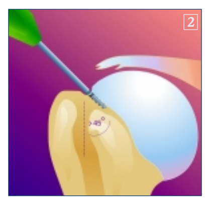
A Bio-Corkscrew Tap is used after the punch in hard bone.