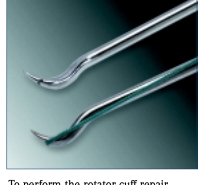
To perform the rotator cuff repair arthroscopically, Suture Hooks (above) may be used in combination with a specifically designed non-traumatic Rotator Cuff Grasper (below).