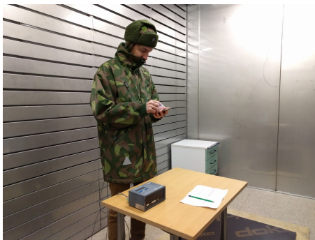
Figure 2: A person completing smartphone tasks in a cold chamber.