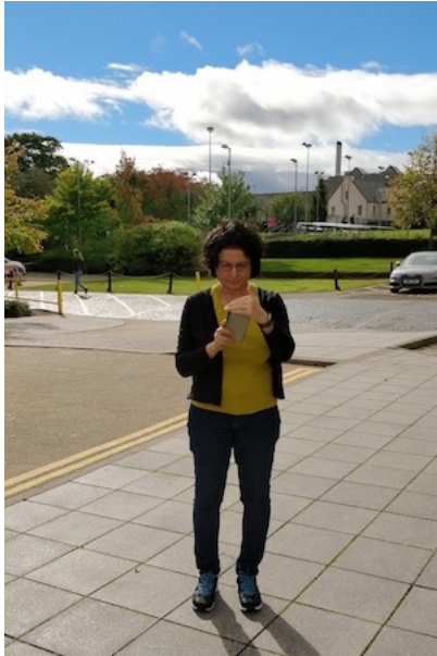
Figure 1: A person trying to use their smartphone while under bright sunlight.