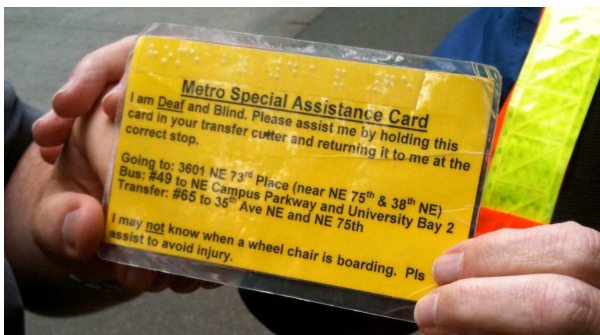
Figure 1. A deaf-blind person holds a card he uses to communicate with a bus driver. (Note the Braille letters at the top that allow him to tell the cards apart.)

Deaf-blind people experience many of the same challenges faced by blind people when using public transit, such as finding the exact location of a stop, boarding the correct bus, and knowing when to disembark. Unlike blind people who can hear, however, deaf-blind people cannot communicate verbally with others. They rely on advance training from an O&M instructor and pre-printed cards (see Figure 1) to convey messages to the bus drivers and other transit riders.