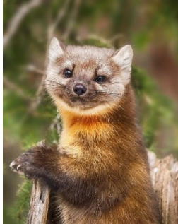
pc-nwest pine marten 1