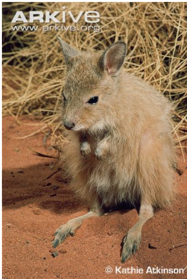
Mala or rufous hare-wallaby ( Lagochetes hirsutus hirsutus )