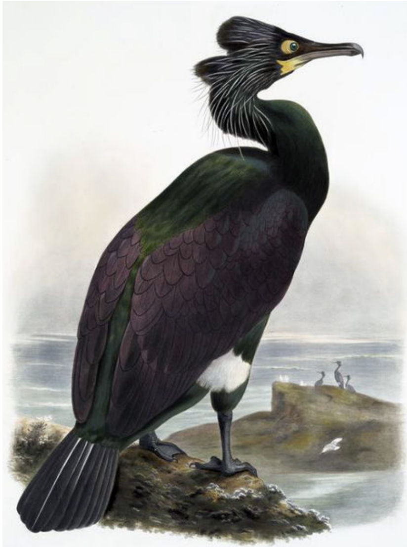
Spectacled Cormorant ( Phalacrocorax perspicillatus )