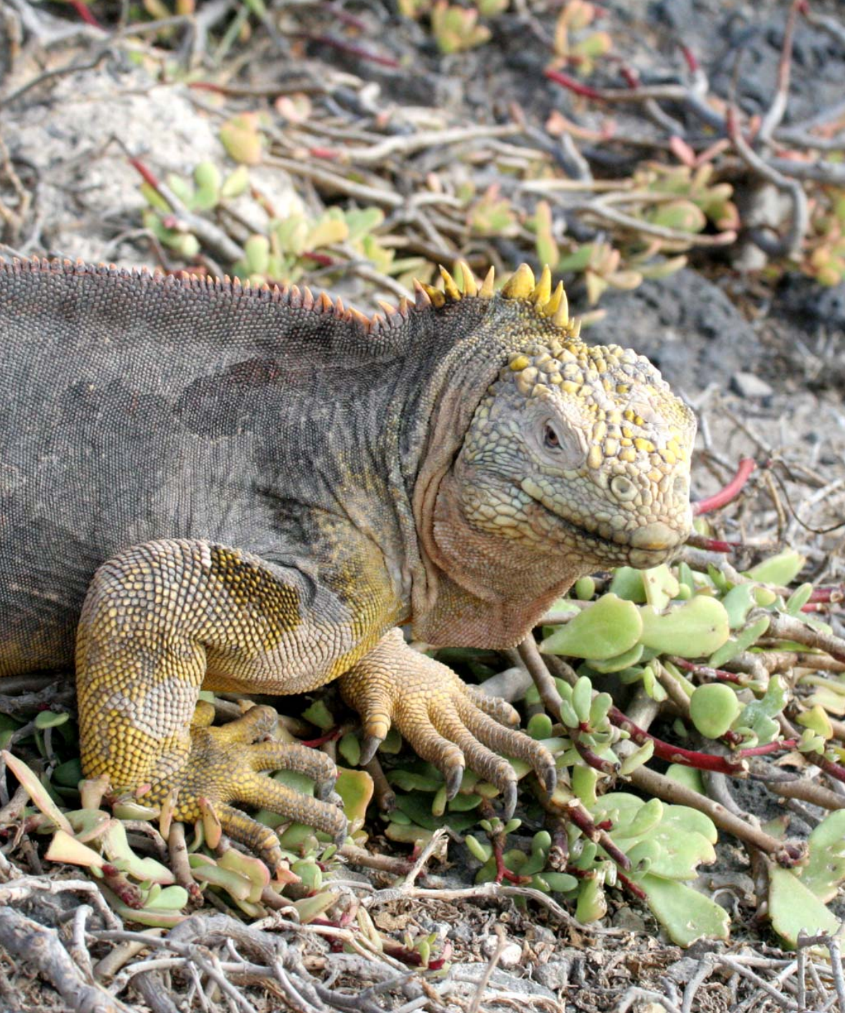
Land iguana Galapagos