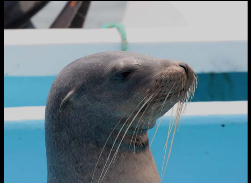
endemic Galapagos sea lion Floreana