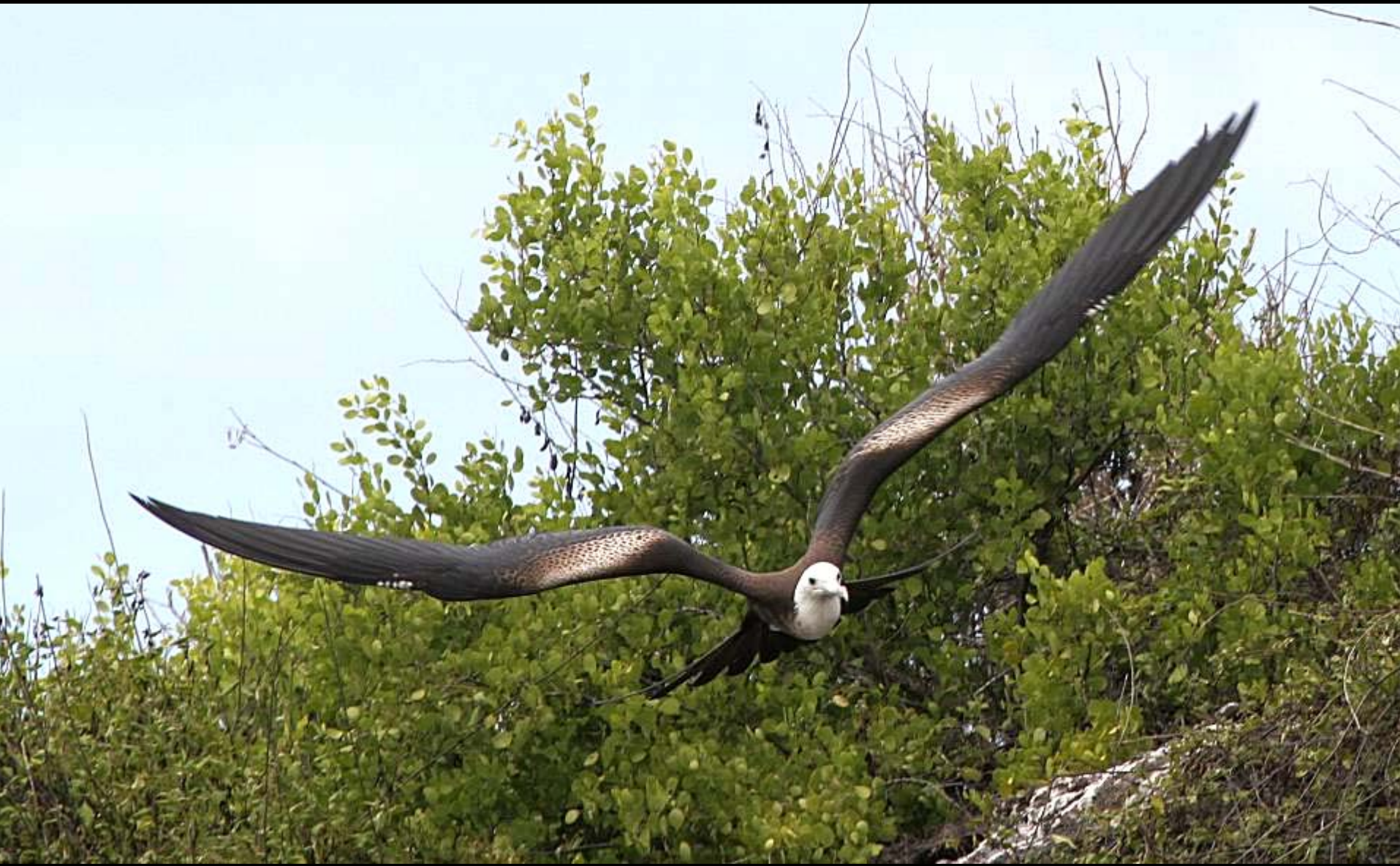
Female frigate bird