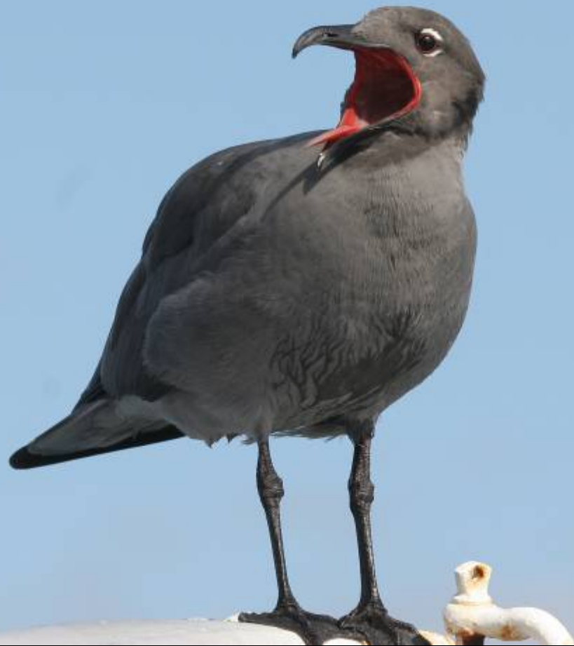
Lava Gull Isla Fernandina, Galapagos