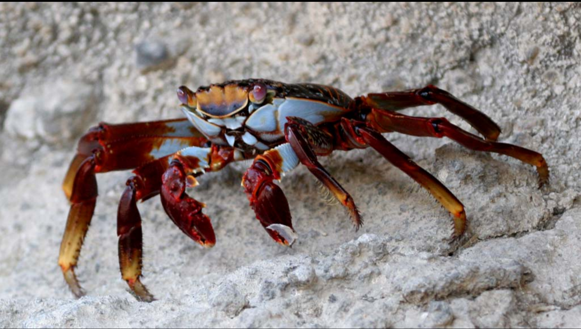
Isla Isabela, Galapagos