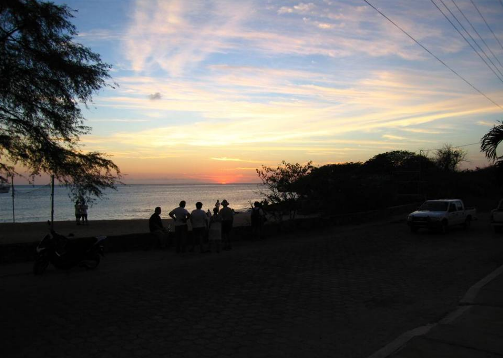
Sunset from GAIAS , San Cristobal, Galapagos