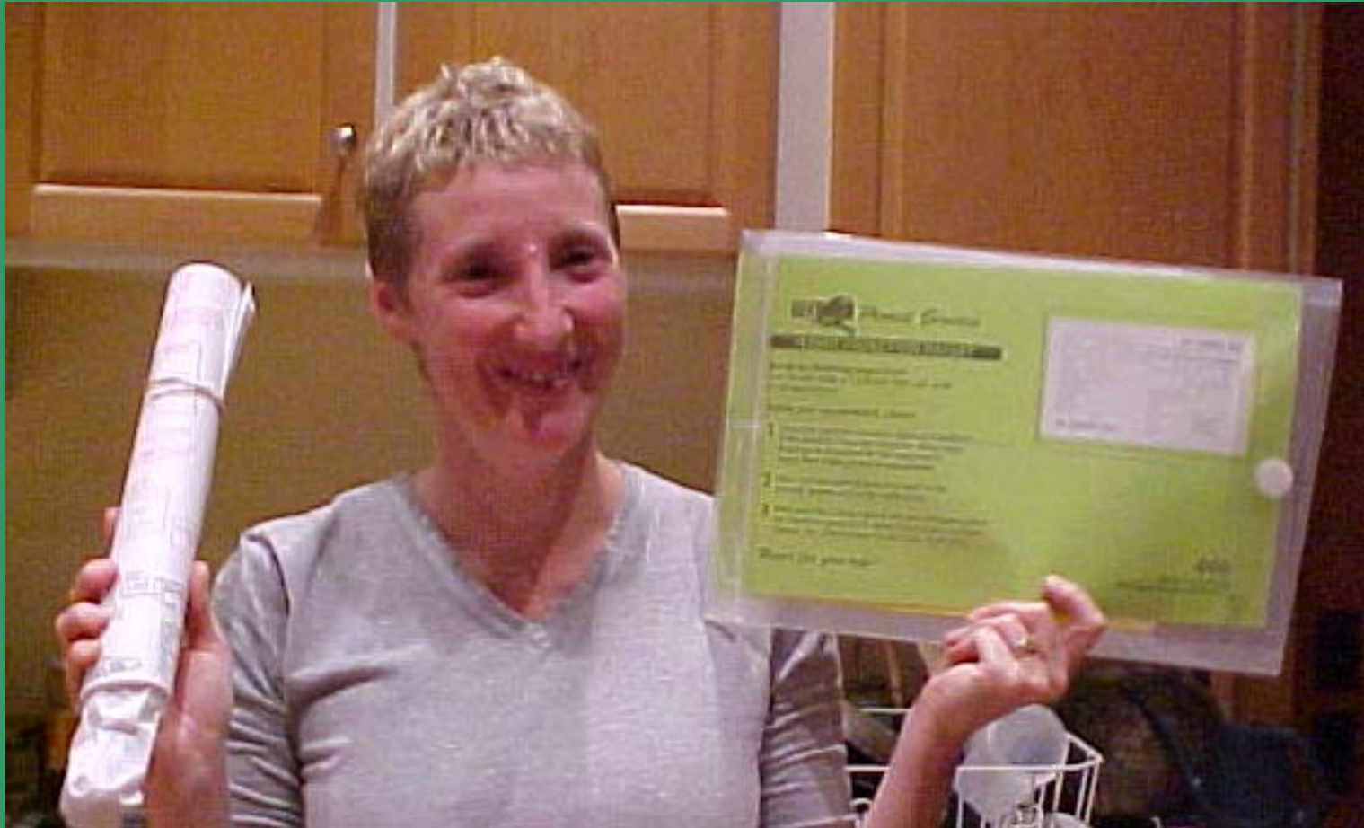
A happy Building Permit holder