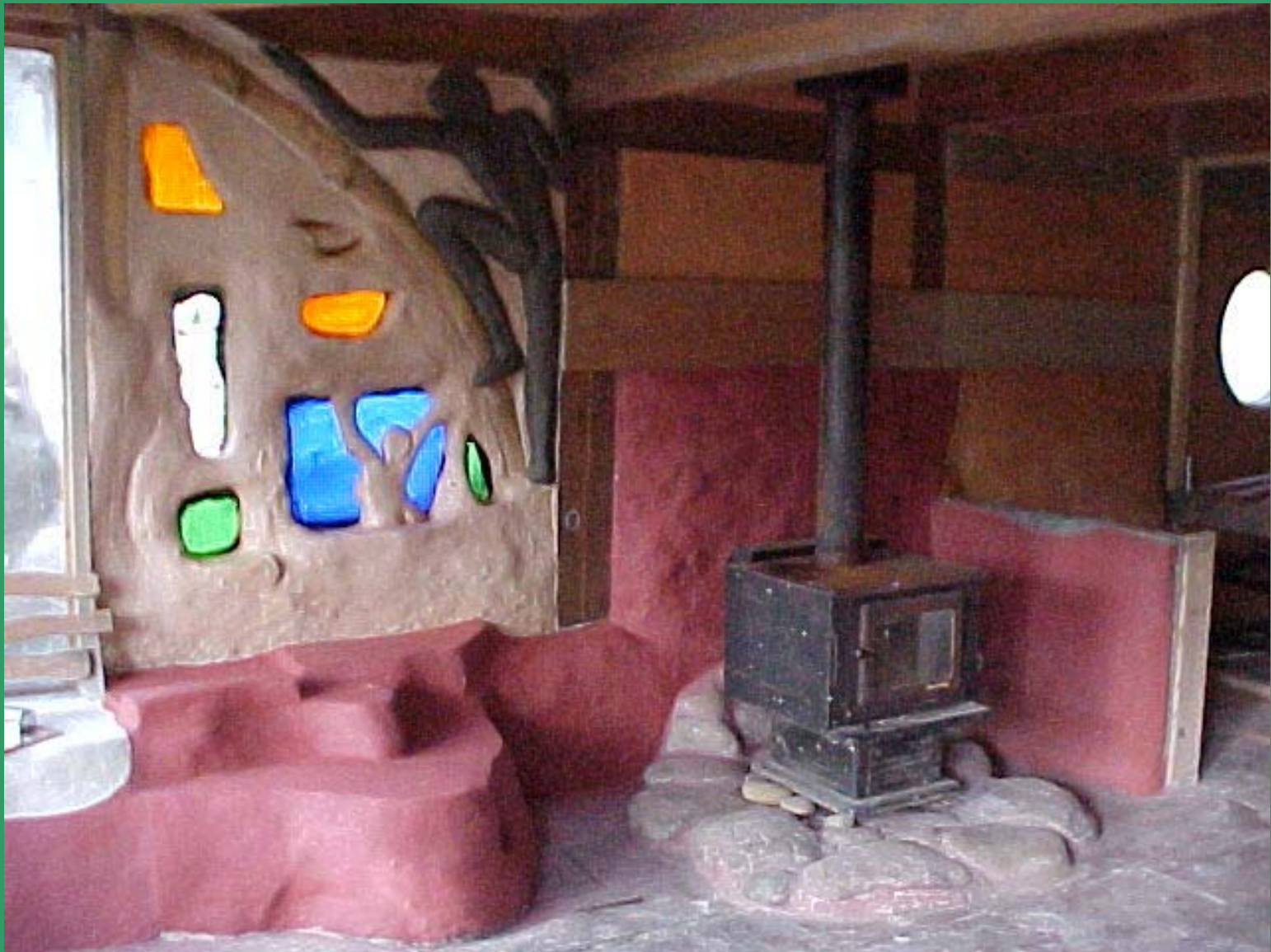
The old wood stove