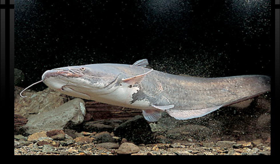
it is likely that catfish can sense minute changes in electrical currents generated underground before a quake. This could account for their sudden bursts of activity at the water surface