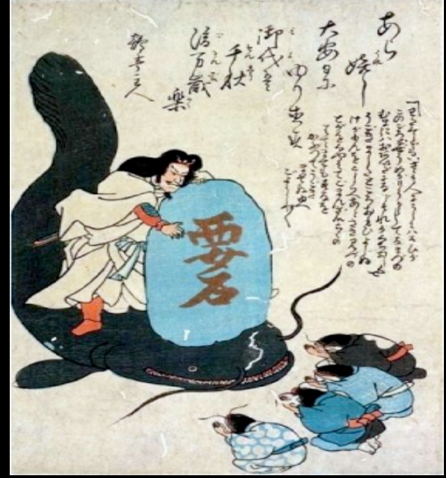
Earthquake Catfish Namazu

✓ 1: Some species of animals can detect changes in the electromagnetic field. Seismic activity can cause changes in the electromagnetic field. These changes can occur hours or days before a quake.