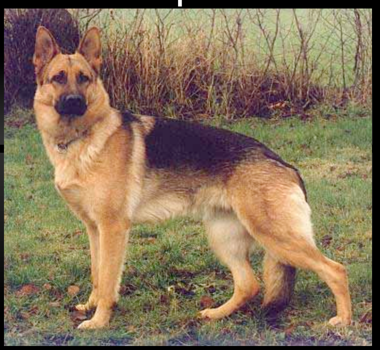
Dogs are able to detect sounds far out of range of the human ear