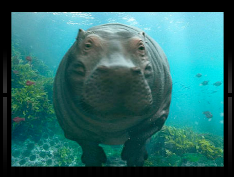
Hippo's can pick up infrasonic soundwaves at great distances