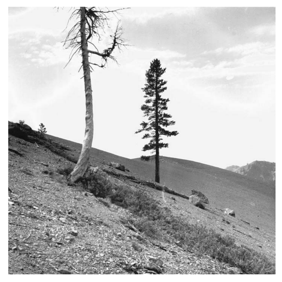
Figure 3 Extremely barren serpentine slopes above De Roux Forest Camp, upper north fork Teanaway River, Wenatchee Mountains, Washington.