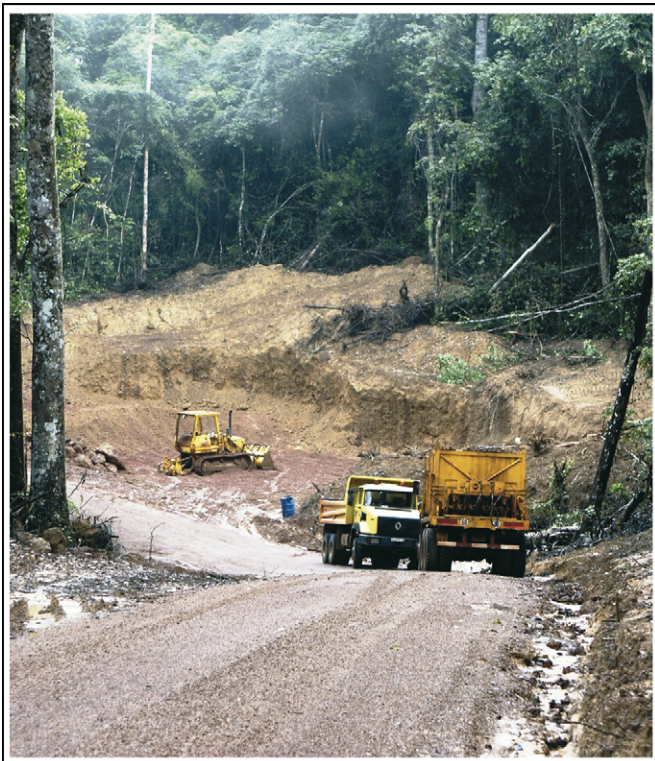
Figure 4. Expanding road networks for timber, oil and mineral extraction, such as this oil-project road in Gabon, promote sharp increases in tropical deforestation.

Another hotly disputed point is whether future pressures on forests will decline as a result of slowing rural population growth. Wright and Muller-Landau conclude that