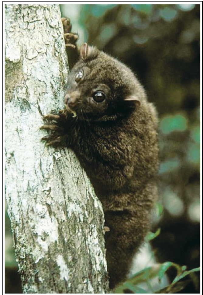
Figure 3. Many old-growth specialists, such as this lemuroid ringtail possum Hemibelideus lemuroides from tropical Australia, avoid fragmented or secondary forests.

Another key consideration is that Wright and Muller-Landau focus on changes in net forest cover, rather than on old-growth forest. As the authors emphasize, in coming decades, vast areas of old-growth tropical forest will be cleared, logged, fragmented, or otherwise degraded, and some cleared areas will regenerate after land abandonment or be replaced by exotic tree plantations. In their projections, all forest types count equally, but the distinction between old-growth and regenerating or fragmented habitats can be profound for extinction-prone species (Figure 3), as various authors have contended (e.g. Refs [19,29–31]). Based on an extensive literature