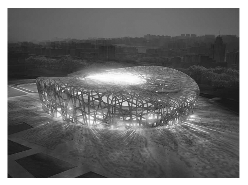
FIGURE 2 Architectural Design of the National Stadium by Herzog and de Meuron

the Eiffel Tower, they claimed that the stadium would become "a unique historical landmark for the 2008 Olympics." With an unusually exposed structure that mimics a bird's nest, the design delivered the most shocking visual impact among all the proposals, capturing the votes of both the international architects and Chinese politicians. The BMPC praised the design highly, commenting that "the pure, simple and powerful building shape blends all into a harmonious whole" and that "the entire building gives a strong sense of dynamics and vigor" (Figure 2).