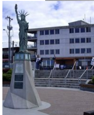
Down 9 steps Down 15 steps