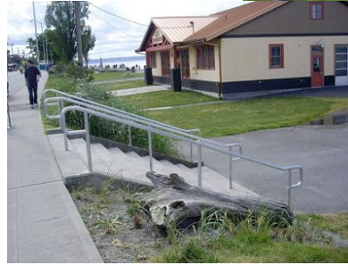
Up 9 steps