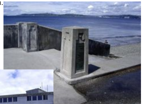
Up 15 steps Up 9 steps