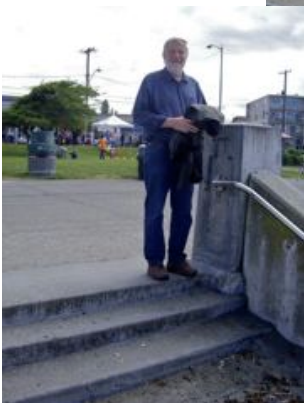
Up 3 steps