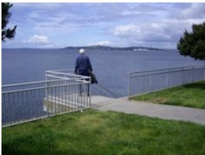
Down and up 21 steps

Start on Alki Ave & Bonair Drive. The first stair goes to the water - go up and down as many stairs as possible.