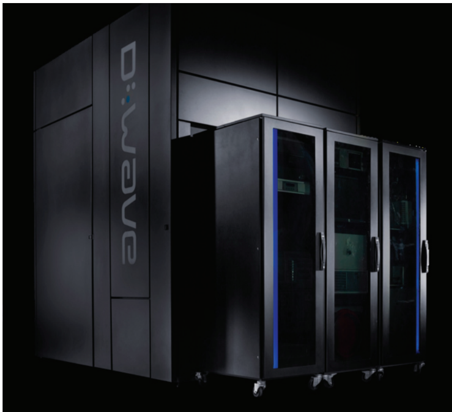
D-Wave 1,000 qubit processor

In support of D-Wave Systems, a CHMPR member, and sponsored by a NASA grant to explore the potential viability of the D-Wave quantum annealing computer which is to be a future disruptive technology, CHMPR staff scientists implemented the largest known working Neural Net multi-hidden layer algorithm (called a Boltzmann Machine in the literature). The D-Wave 2X system is owned by Google and shared with NASA Ames.