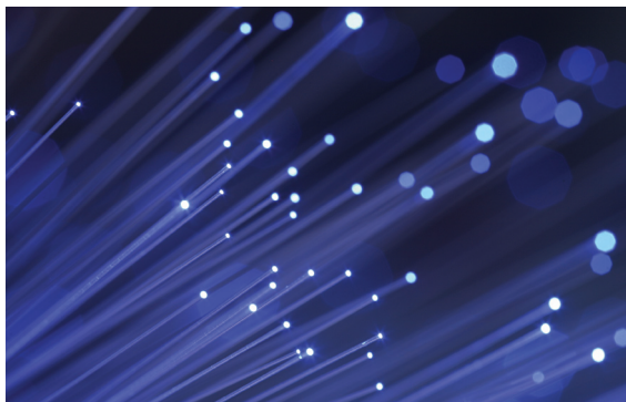
Fiber optic coatings are one potential use for this technology.

Novel (meth)acrylate monomers for ultra-rapid photopolymerization have been developed by researchers at the Photopolymerizations Center (PC). This program has identified and characterized several new monomers that provide highly photosensitive acrylate compositions with excellent physical and mechanical properties. These materials have potential for the design of improved structural adhesives in engineering applications. One application noted by UCB Chemicals is that of inks used in printing on food packages. Fast-reacting monomers can reduce both cost and food contamination. The fast-reacting monomers result in inks that dry faster and in packaging