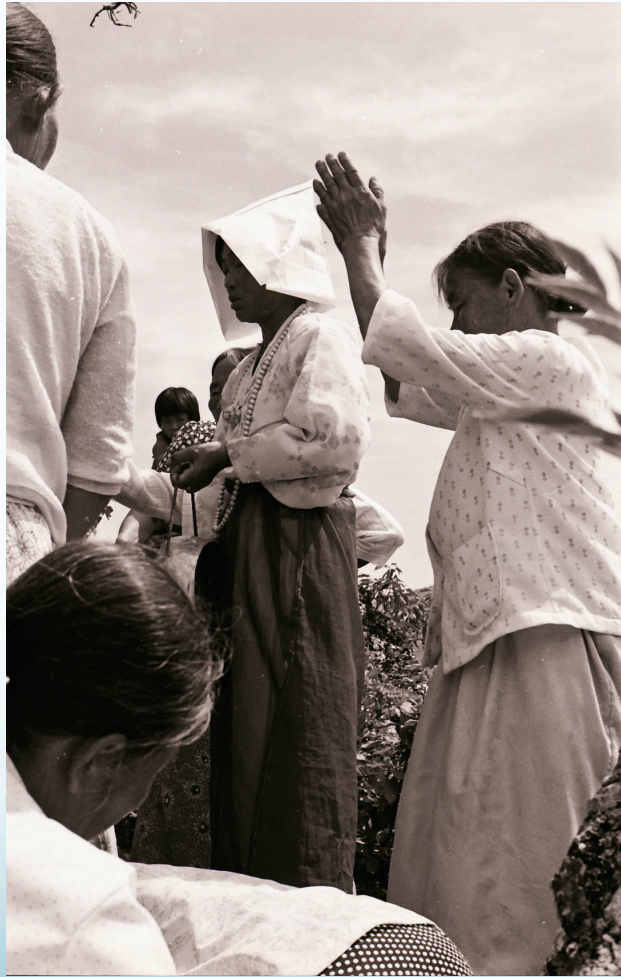
Shaman in 1977