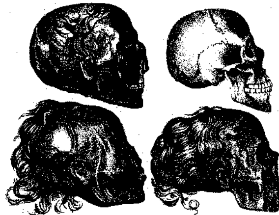
Lithograph of mummified Egyptian skulls published in Samuel Morton's Crania Aegyptiaca (1844).

multiple racial creation (polygenesis). Still operating within a biblical framework, his theory held that the various races had been created separately and each given specific, irrevocable characteristics. After inspecting several mummies from the ancient Egyptian catacombs, Morton concluded that blacks and Caucasians were already distinct three thousand years ago. Since his Bible indicated that Noah's Ark had washed up on Mount Ararat only a thousand or so years before this, Morton reasoned that Noah's sons could not possibly account for all the modern races. Therefore, the races must have been separate from the start. Thus Morton's theory of polygenesis attracted a loyal and enthusiastic following.