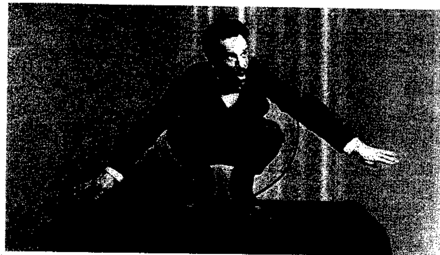
Franz Boas (above) demonstrating a pose of the Kwakwaka'wakh (Kwakiutl) hamatsa dancer for model makers at the U.S. National Museum (February 1895). The Hamatsa life-group (below) as displayed in the Smithsonian exhibit (ca. 1896).

The question naturally arose about what to do with the huge anthropological collection amassed in Chicago. Some of it went to California's Mid-Winter Exposition, and Washington State took parts for the state museum in