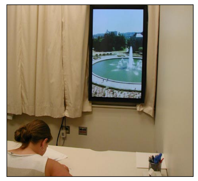
Figure 2. Person (demonstrator) working in an office with a "window of the future" – a large screen plasma display that is projecting real-time HDTV images of the local outdoor scene.

In shaping their research, Kahn et al. explicitly drew on Value Sensitive Design. Three ideas are worth highlighting. First, Kahn et al. engaged in an initial conceptual investigation of the values implicated and stakeholders affected by such projection technology. At that point, it became clear that an important class of indirect stakeholders (and their respective values) needed to be included: namely, the individuals who, by virtue of walking through the fountain scene, unknowingly had their images displayed on the video plasma display in the "inside" office. In other words, if this application of projection technology were to take hold societally (as web cams and surveillance cameras have begun to) then it would potentially encroach on the privacy of individuals in public spaces – an issue that has been receiving increasing attention in the field of computer ethics and public discourse [17]. Thus, in addition to their experimental data collection with potential users of this future plasma window (direct stakeholders), Kahn et al. embarked on two additional but complementary empirical investigations with indirect stakeholders: (a) a survey of 750 people in the