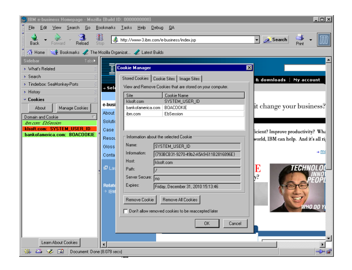
Figure 1. Screen shot of the Mozilla implementation showing the peripheral awareness of cookies interface (at the left) and the justin-time cookie management tool (in the center). Each time a cookie is set, a color-coded entry for that cookie appears in the sidebar. Third party cookies are red; others are green. At the user's discretion, he or she can click on any entry to bring up the Mozilla cookie manager for that cookie.

Friedman et al. then used the results from the above conceptual and technical investigations to guide their redesign of the Mozilla browser (the open-source code for