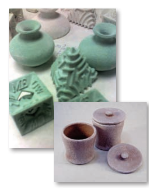
Sample parts printed using UWME ceramic powders, including fully glazed pots

Three-dimensional printers have become common in the industrial world, churning out fast 3D prototypes of everything from airplane parts to running shoes. The machines also are becoming popular among artists, hobbyists, and in high schools. The materials used in 3D printing, however, can be very expensive.