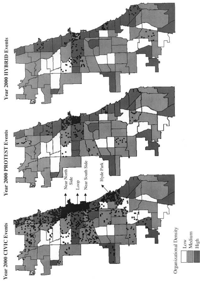
FIG. 3.—Spatial distribution of organizational density and collective action events, by type: Chicago, 2000