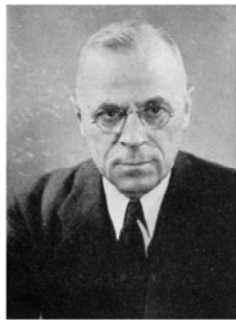
Edwin H. Sutherland

Sutherland, Edwin. 1947. Principles of Criminology. Philadelphia, PA: Lippincott