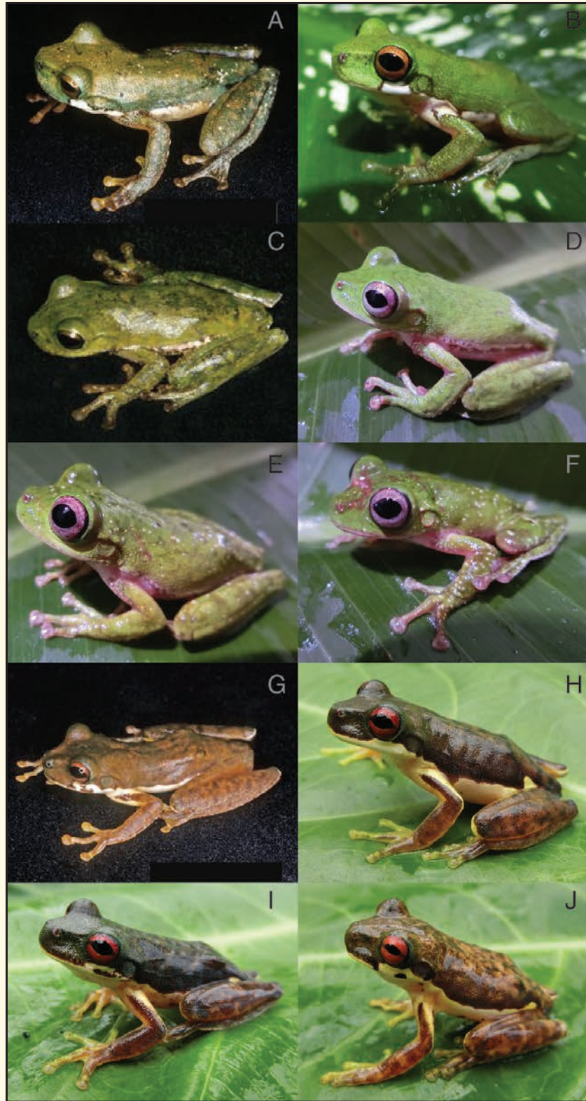
Fig. 2. Color variation in specimens of the genus Duellmanohyla . D. chamulae (A = KU 58062; and B = UWBM 9204); D. ignicolor (C = KU 87160; D = UWBM 9205; E = UWBM 9206; and F = UWBM 9207); D. schmidtorum (G = KU 58016-29; H = UWBM 9208; I = UWBM 9209; and J = UWBM 9210). A, C, and H correspond to specimens previously collected (AmphibiaWeb, 2016).