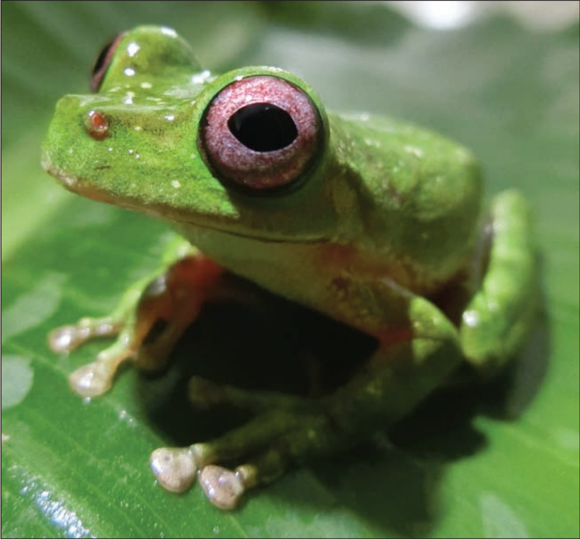
Hylid frogs are some of the most charismatic and endangered anurans in Mexico. During a time where amphibian extinctions are becoming a common occurrence, it is important to celebrate rediscoveries. With rediscoveries of endangered species also comes an urgent need to acquire basic natural history information and population data. Pictured here is an individual of Duellmanohyla ignicolor found near La Esperanza, Oaxaca, Mexico.