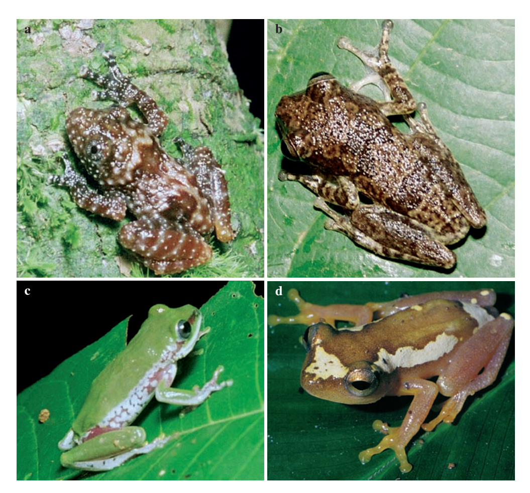
Fig. 6. a. Juvenile Acanthixalus sonjae (SVL 24 mm) from Ankasa Conservation Area; b. Hyperolius bobirensis from Ankasa Conservation Area; c. Hyperolius cf. fusciventris lamtoensis female from Ankasa Conservation Area (SVL 47 mm); d. Hyperolius laurenti from Draw River Forest Reserve.

Coast. Two calling males and one female were recorded on 25 October 2003 at around 10:30 h at DR. Males were calling in the vicinity of small puddles in a comparatively open area at the reserve boundary in close vicinity to previously cultivated land. The call was not recorded; however, its tonal quality seemed to be very similar to the calls from P. phyllophilus RÖDEL & ERNST, 2002. Similar to the previous species males were never observed calling completely exposed. Additional individuals were recorded on 10 October 2003 at around 15:30 h at BT. This species might be confused with several other