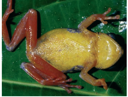
Fig. 8. Dorsal (above) and ventral (below) aspect of female Hyperolius viridigulosus from Draw River Forest Reserve.

sibly representing an undescribed species. Males measured 52-59 mm SVL (mean = 54.8 mm, N = 9). One gravid female measured 52 mm SVL. One metamorph measured 23.5 mm SVL.