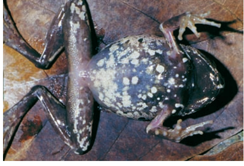
Fig. 5. Dorsal (above) and ventral (below) aspect of unnamed Arthroleptis from Krokosua Hills Forest Reserve.