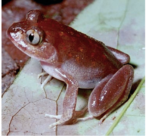
Fig. 4. Unnamed Astylosternus species from Ankasa Conservation Area.

Amnirana occidentalis Perret, 1960 is a rarely encountered primary rainforest frog (Rödel & Bangoura 2004) with a very patchy distribution in the Upper Guinean forest zone (GAA). In Ghana, this species so far was only known from Kakum National Park [ZMUC 73577, adult female, Schløtz (1964) as A. albolabris; Perret 1983 referring to Schløtz's specimen). We herein add records from ACA (juvenile, SVL 18 mm) and BT (adult male, SVL 58.8 mm).