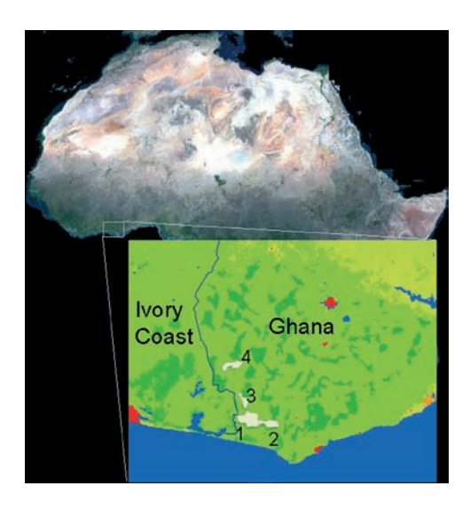
Fig. 1. Study area in south-western Ghana. Only dark green areas represent still primary forest. 1 = Ankasa Conservation Area. 2 = Draw River Forest Reserve. 3 = Boi-Tano Forest Reserve. 4 = Krokosua Hills Forest Reserve.

(Appendix 1). In DR, BT and KH, each trap array comprised a single straight line fence (15 m) with six buckets (approximately 10 l). In ACA we employed a three-arm array, 10 m per arm, with seven buckets. Traps were checked every morning and during the day. Drift fence orientation was tailored to local conditions.