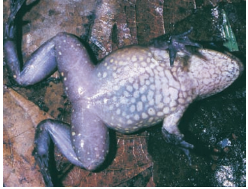
Fig. 3. Dorsal (above) and ventral (below) aspect of Aubria subsigillata from Boi-Tano Forest Reserve.

bria frogs from the complete range including the various type species. According to her, two species can be differentiated, almost exactly fitting the diagnostic characters used by Perret (1994). However, the type of A.