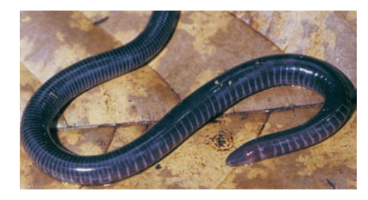
Fig. 2. Geotrypetes seraphini occidentalis from Draw River Forest Reserve.

In ACA and BT, we recorded frogs of the genus Aubria (Fig. 3). These large, nocturnal, aquatic West and Central African forest frogs normally live in swamps and along small forest rivers. Their black tadpoles form schools and adults are known to feed on fish and other amphibians (SCHIØTZ 1964a, KNOEPFFLER 1976, HUGHES 1979, PERRET 1994). In recent years the taxonomic status of these frogs from various populations has been debated and changed several times. The recently described A. masako Ohler & Kazadi, 1990 from the "Forêt de Masako", approximately 15 km from Kisangani, Democratic Republic of Congo, was suggested to lack femoral glands (OHLER & KAZADI 1990). According to the original description, it is only known from the type locality, and OHLER & KAZADI (1990) assigned all other West and Central African records to A. subsigillata (Duméril, 1856), originally described from Gabon (holotype MNHNP 1566). PERRET (1995 "1994") realized that the known vouchers of A. subsigillata from West and Central Africa actually comprised two different species. He distinguished a short legged Central African taxon with femoral glands that are relatively close to the knee (A. subsigillata) and a species occurring in West and coastal Central Africa forests with longer legs and glands, positioned half way between knee and vent. The latter he described as A. occidentalis Perret, 1995 "1994" (holotype MHNG 2129, from Banco forest, Ivory Coast). OHLER (1996) reexamined Au-