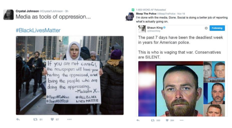
Fig. 8. Examples of 'left' RU-IRA tweets criticizing traditional media.

5.3.3 Converging to attack the 'mainstream' media: RU-IRA accounts in both clusters converged by using #BlackLivesMatter discourse and their constructed political identities to criticize the 'mainstream media'. The @BlackmattersUS profile description and website slogan of "I didn't believe the media so I became one" effectively summarizes this message, which was also carried forward by personal style RU-IRA accounts on the left. These accounts mixed content that A) expressed frustration with how older traditional media institutions cover issues like officer related shootings and the #BlackLivesMatter movement itself; and B) equated these long-standing institutions with tools of oppression. Figure 8 illustrates more and less direct versions of this message. The second tweet in this example shows @BleepThePolice (boosted by another RU-IRA account) repurposing a message by @ShaunKing to hold up social media as a viable alternative to "the media".