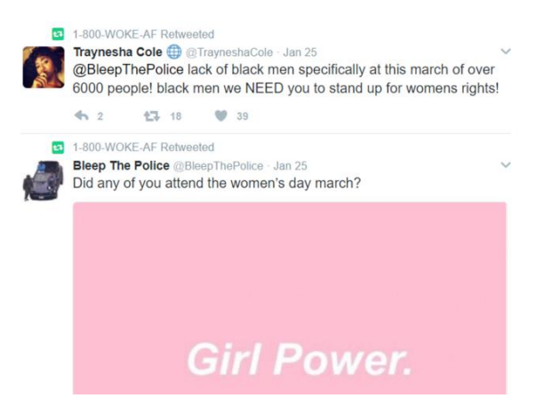
Fig. 5. Three RU-IRA accounts retweeting each other.

5.2.3 Coordination to Build Trust: On social media, interacting with streams of user-generated content produced by one's personal network is central to exhibiting 'evolving connectivity' [44] and cultivating trust [17]. We did not observe explicit interaction between RU-IRA accounts when they were in different clusters, but we did observe accounts from within the same cluster mentioning and retweeting each other over a variety of topics. For instance, for a researcher reading their content, the users @gloed_up, @BleepThePolice and @TrayneshaCole gave the impression that they were part of a social clique. Their occasional, casual interactions projected authenticity while also enabling them to better manage their audience's attention by generating 'buzz' around certain topics such as protests or other news items. Figure 5 below furnishes an example that succinctly captures the flavor of interactions between these accounts.