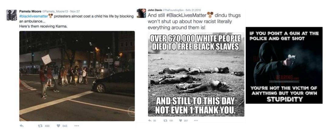
Fig. 7. RU-IRA content about #BlackLivesMatter in right-leaning cluster.

their perceptions of others and the possibility of civil dialogue. Simultaneously, critics of the #BlackLivesMatter movement could see RU-IRA content that focused more on attacking police and less on the movement's core messages. Both groups of users were also being selectively presented with news and information from these accounts that possibly played to pre-existing beliefs and biases (e.g. #BlackLivesMatter affiliated protesters behaving as looters and executing police officers / police officers sexually assaulting black citizens). In summary, RU-IRA accounts were acting as both information distributors and antagonistic stereotypes of ethno-cultural others .