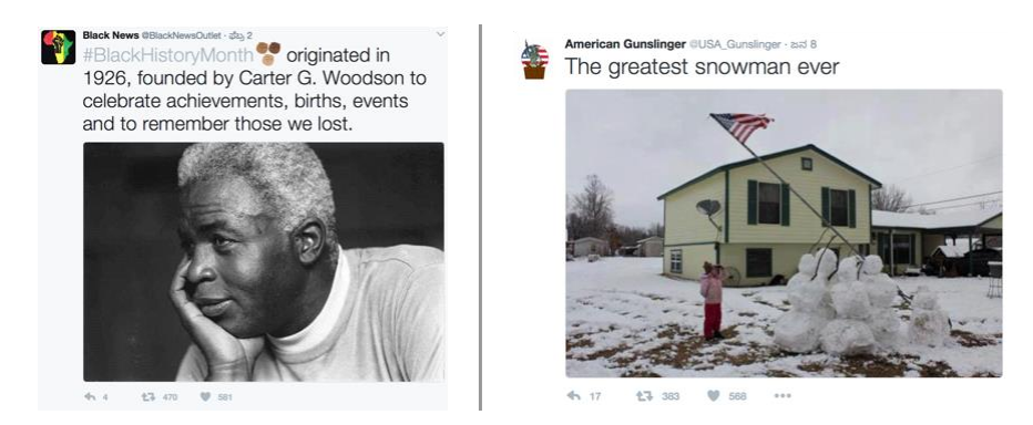
Fig. 4. Sample tweets circulated by RU-IRA accounts in separate clusters to cultivate trust.

Other accounts like @USA_Gunslinger and @KarenParker93 followed similar patterns and used hashtags like #WednesdayWisdom to tweet pictures of snowmen holding up an American flag (see Figure 4) and children pretending to be police officers.