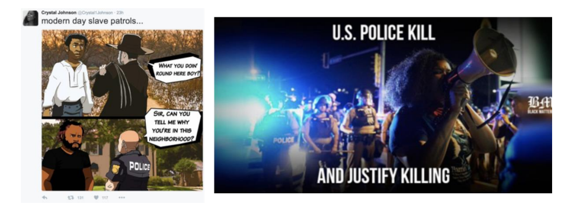
Fig. 6. Example memes circulated by RU-IRA accounts in the left cluster.

@CrystallJohnson: Blue's a job, that shit don't matter! #BlackLivesMatter!