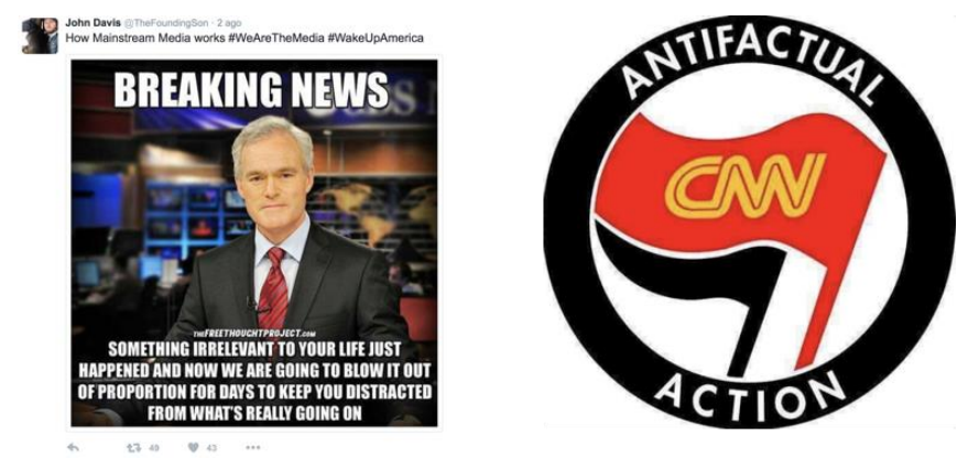
Fig. 9. Examples of 'right' RU-IRA tweets criticizing traditional media.

@TheFoundingSon: While the NYT tells you how Soros fights hate crimes his agenda incites hate towards police officers which results in tragedies #KeithScott