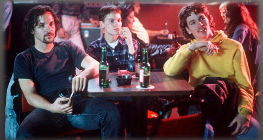
Still from Boys Don't Cry (1999).