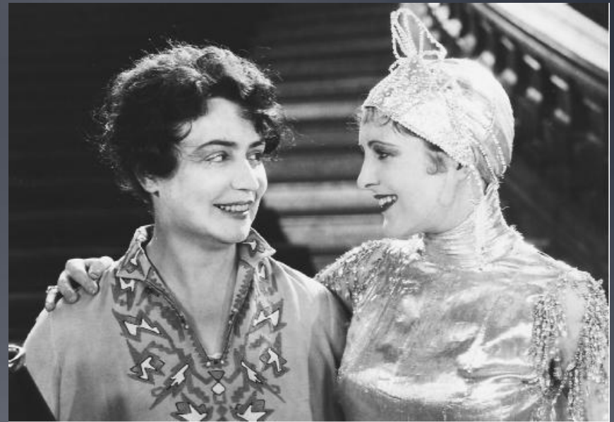
With Billie Dove on the set of The Sensation Seekers (1927)