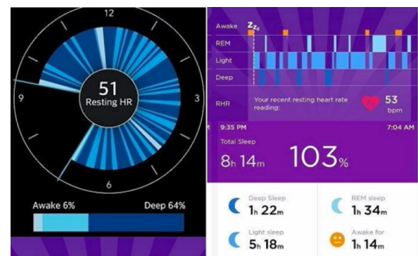
Figure 2. R195's comparison of one nights' sleep stage feedback from two separate devices. (Left) Mio Fuse infers 64% of sleep spent in deep sleep. (Right) Jawbone Up3 infers 16.5% deep sleep (shown as 1hr 22mins out of 8hrs and 14mins).

In line with previous work [34], some users conducted a self-experiments on their sleep and make correlations from their findings. However, the focus on sleep stages led users to make unscientific correlations between daily behaviors and specific sleep stages. For example, R8 correlated deep sleep with a late meal: “Last night, I had a late meal and that wasn't the best for me... I wake up this morning and see that... I got very little [deep] sleep compared to my average