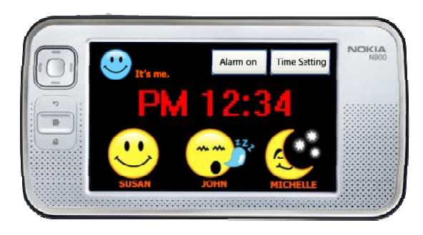
Figure 2. BuddyClock's user interface on the Nokia N800. Users interact with BuddyClock using a touch screen display.

network via wireless connection to a remote BuddyClock server, which shares real-time alarm status with others. The BuddyClock server application is implemented in Python on a standard desktop PC.