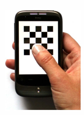
Fig. 1. PVT-Touch running on an Android phone, with stimulus visible. The checkerboard pattern provides a high-contrast, obvious signal to participants.

The original implementation of PVT was on purpose-built hardware designed for lab use only [1]. However, researchers are moving toward mobile implementations in order to assess sleepiness in everyday life and to gather more ecologically valid data. An implementation for Palm OS [3] that has users press a physical button on a PDA is currently the most widely adopted version. Unfortunately, Palm OS devices are no longer being manufactured as of 2009<sup>1</sup>, so use of this version is unsustainable for researchers and requires users to carry an additional device. Implementations for more current mobile touchscreen platforms, such as iOS and Android, would allow these assessments to be used in research studies and for con-