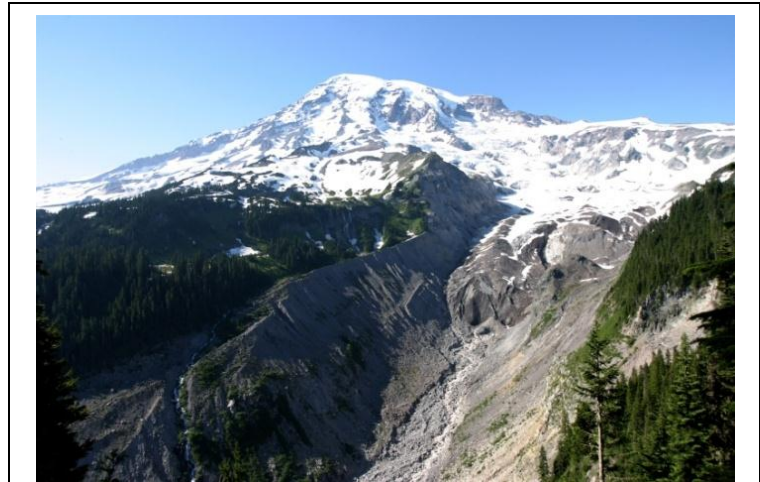
Figure 1. The Nisqually Glacier, situated on the South side of Mount Rainier, has receded over the last century and exposed a large amount of unstable soil. Destructive debris flows have originated from these recently exposed areas (photo credit: wikimedia.org).

soil, rocks and other objects in the debris flow settle out and begin to accumulate in the riverbed, increasing the height of the channel in a process called aggradation . Because of the large amount of loose soil exposed by glacial recession in the Park, substantial aggradation occurs even during periods of normal river flow. However, aggradation is especially rapid during debris flows spawned by heavy rains. For example, the background rate of aggradation is 15 – 36 cm (6-14 inches) per decade in the Park’s braided rivers, but around 1.8m (6 feet) of material was deposited along a section of the Nisqually River during a single debris flow. In other words, around 30 – 70 years’ worth of background aggradation occurred in the span of a few days (Beason and Kennard 2007).