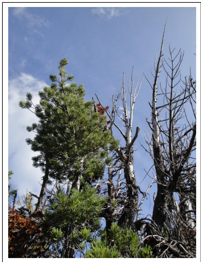
Figure 4. Patch of live and dead whitebark pines near Sunrise.

The high elevation habitats of whitebark pines have historically been too cold to allow MPB populations to reach epidemic proportions in most years (Logan and Powell 2001). However, outbreaks have occurred in whitebark pine stands in the past in conjunction with above average